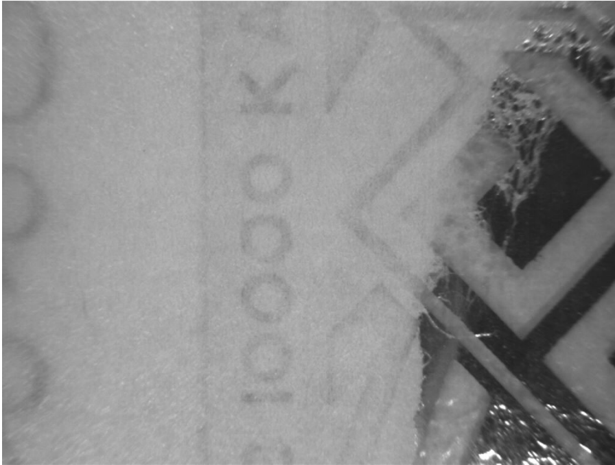
Infrared top light (940 nm) 1x