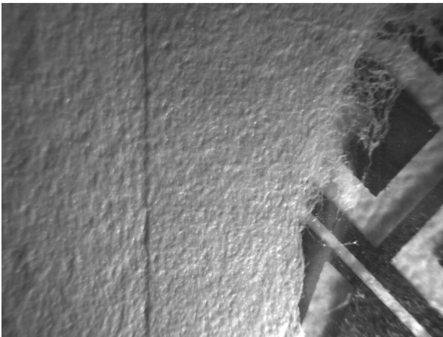
Infrared oblique light (880 nm) 1x