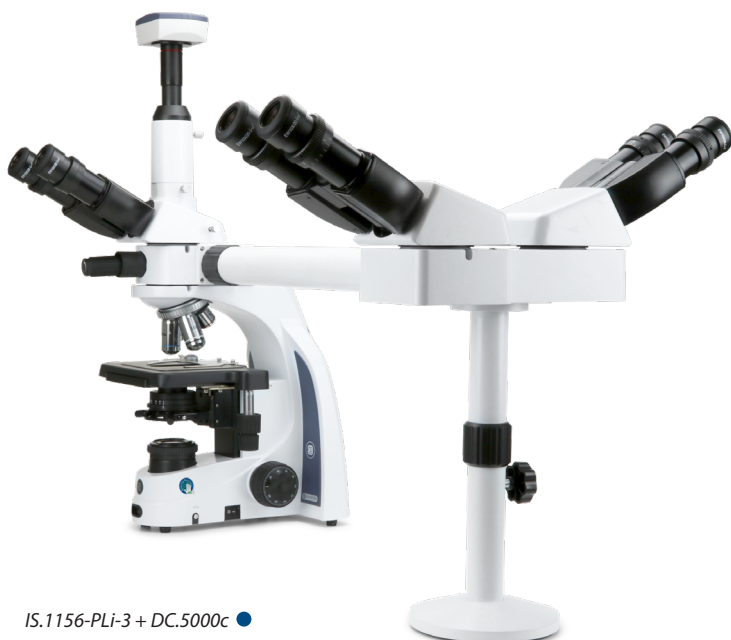
IS.1156-PLi-3 + DC.5000c ●