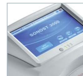
Touch screen color monitor