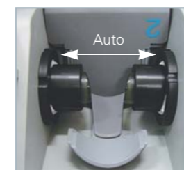
Auto-moving table with waterless probes