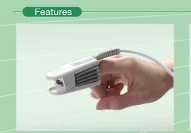
Unique Sensor Design