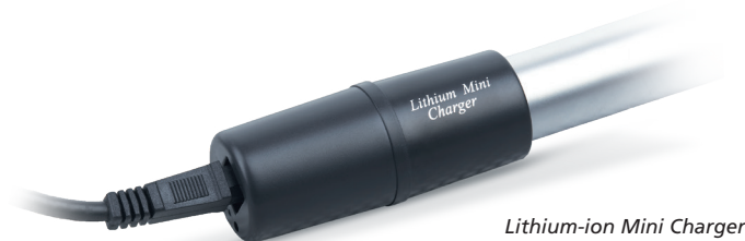
Lithium-ion Mini Charger

Can be connected quickly and simply to the base of your Keeler handle, making it the perfect choice for domiciliary visits or practitioners on the move. Your instruments can still be used whilst the battery is charging.