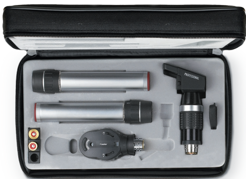
Professional Ophthalmoscope/Retinoscope Set