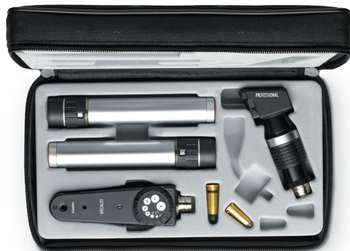
Specialist Ophthalmoscope/Retinoscope Set

You can purchase your Ophthalmoscope and Retinoscope in a slimline double handle case and add in a Lithium Double Charger.