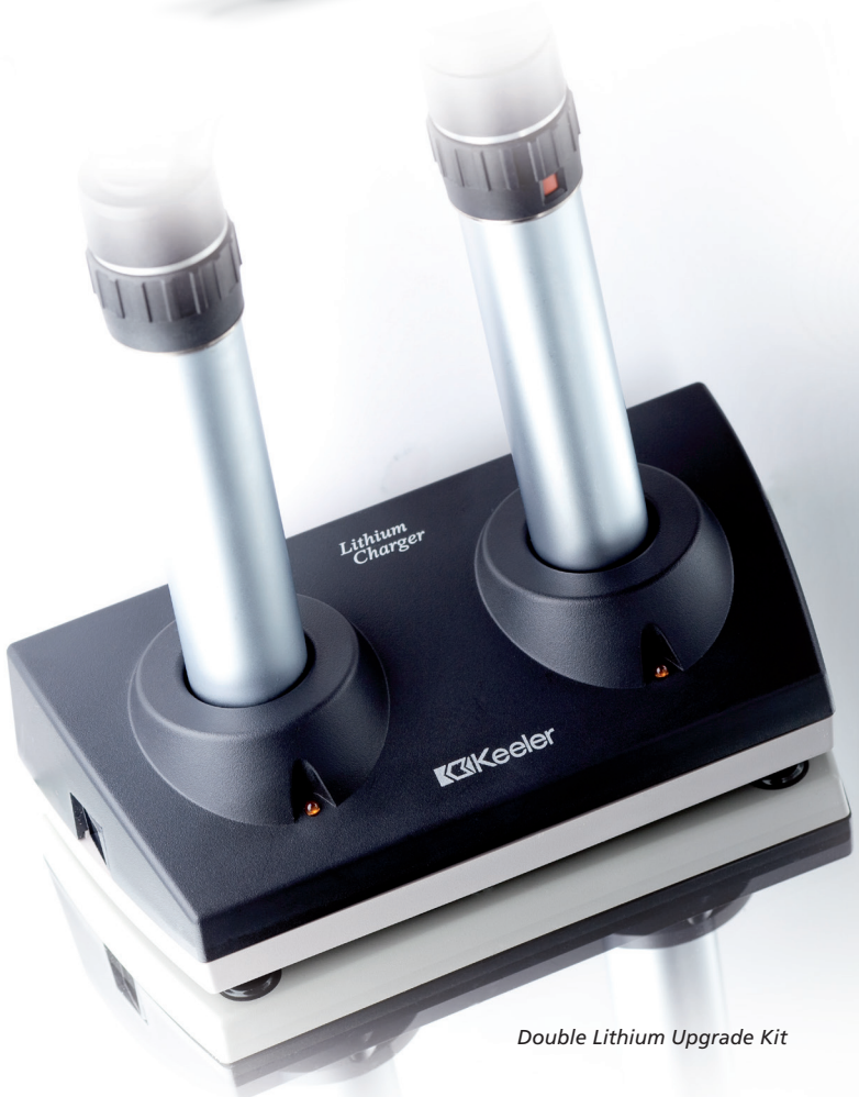
Double Lithium Upgrade Kit