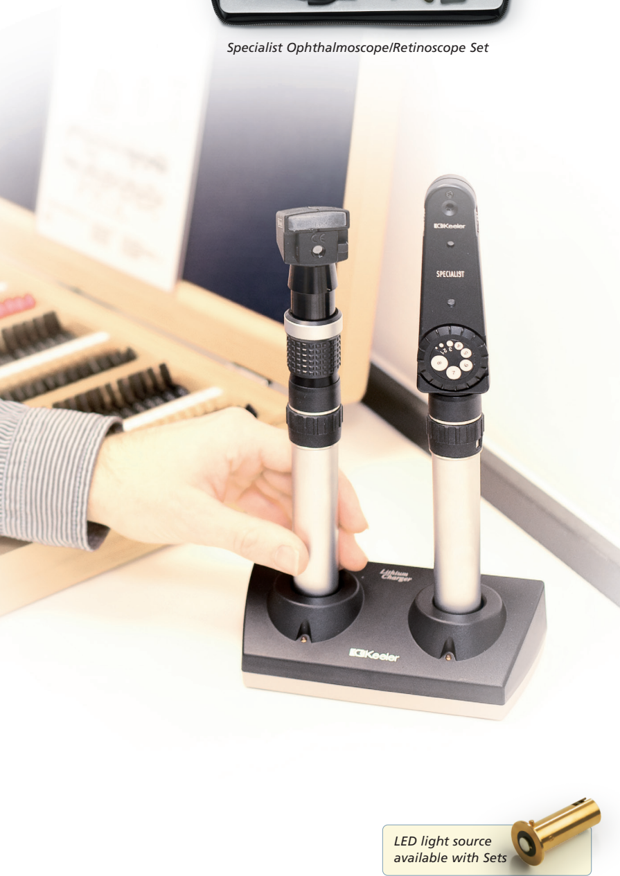
LED light source available with Sets