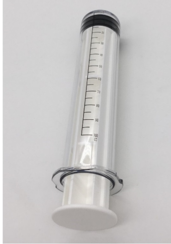
100ml Syringe AS-100