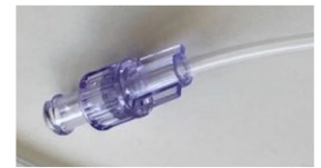
Y Connector Connecting Tubing with One Check Valve 350PSI