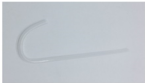
J quick fill tubing