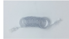
Pressure Connecting Tubing 150cm x 350PSI