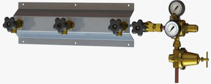
Economy Manifold with an optional main hi-pressure shut-off valve

Our manifold is designed for the supply of continuous and smooth gas flow at the pressure of up to 8 bars (higher outlet pressure upon customer request).