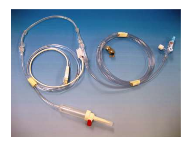
Cool Point Tubing Set specially designed for easy connection. An in-line occlusion sensor helps ensure safe operation.