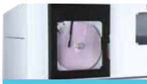
OPTIONAL GRAPHICAL CHART RECORDER