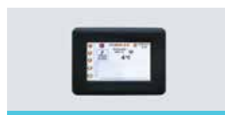
OPTIONAL TOUCH SCREEN DISPLAY