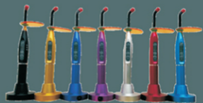
CURING LIGHT KS-LC205 光固化