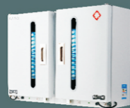
UV CABINET KS-UV-II UV消毒柜