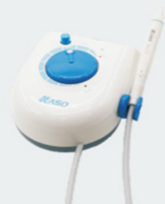
SCALER KS-S5 超声波洁牙机