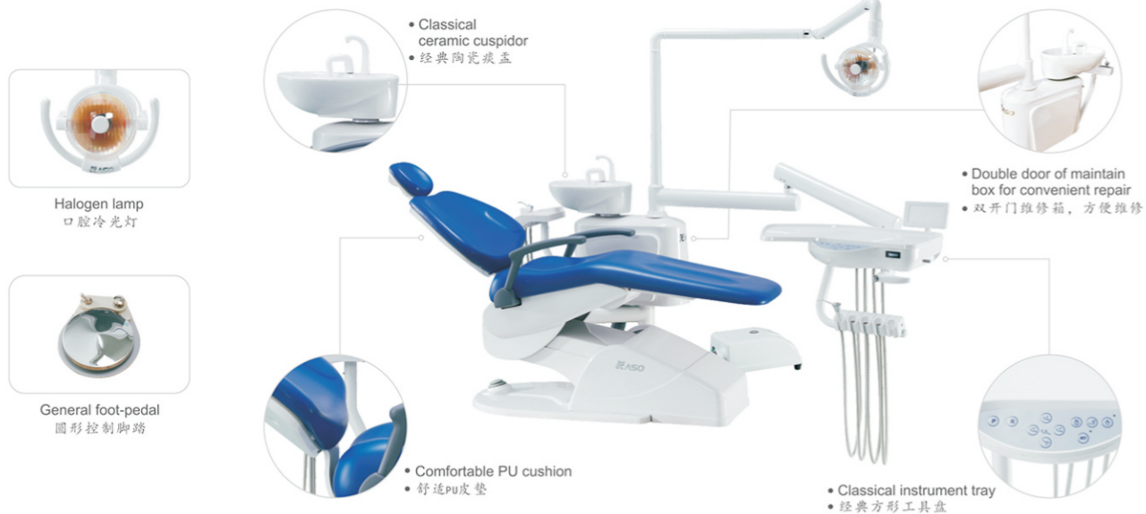
Halogen lamp 口腔冷光灯