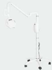
TEETH WHITENING KS-W117 美白仪