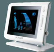
APEX LOCATOR KS-A1008 根管测量仪