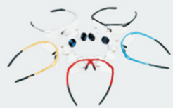
3.5X DENTAL LOUP LED HEADLIGHT KS-SL01 3.5倍带LED灯放大镜