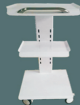
MOBILE CABINET KS-OT03 牙科移动柜