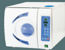
AUTOCLAVE KS-22L 灭菌器