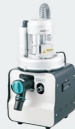
SUCTION PUMP KS-SP03 抽吸泵