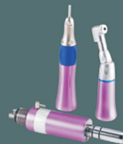
HANDPIECE KS-LP-II 低速手机