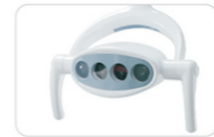
sensor LED lamp 可调色温感应LED冷光灯， 手柄可拆卸，便于消毒