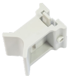
Pole mounting bracket