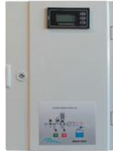
BUDGET CONTROL CARD