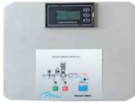
BUDGET CONTROL CARD