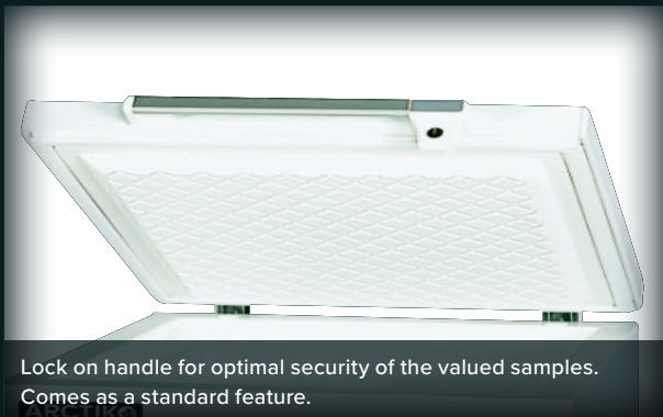
Lock on handle for optimal security of the valued samples. Comes as a standard feature.