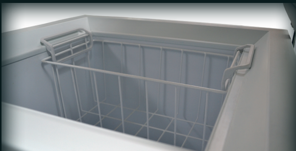
Optimal storage capacity and overview of the stored samples with the baskets.