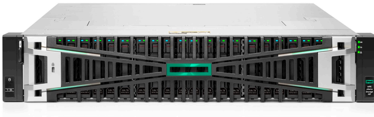
HPE Alletra Storage MP B10000 (2-Node all NVMe Storage Base)

Get an intuitive, AI-driven cloud experience on-prem that simplifies management and shifts operations from infrastructure-centric to app-centric. Scale performance and capacity independently — and without disruption — with disaggregated storage. Meet every SLA with mission-critical storage that delivers an unrivalled 100% Data Availability Guarantee.