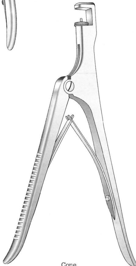
Cone J-25-750 22.5 cm / 9" Cranial punch