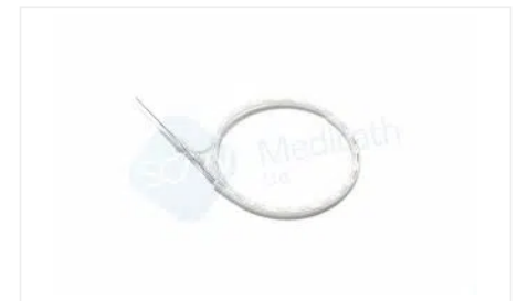
Stainless Steel Guide Wires