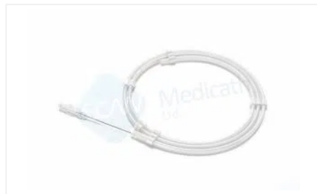
PTCA Balloon Catheter