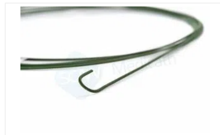
PTFE Coating Guide Wires