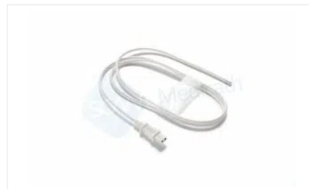
General Purpose Temperature Monitoring Probe