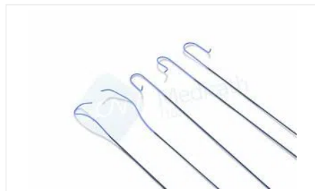
Radiology Angiographic Catheter