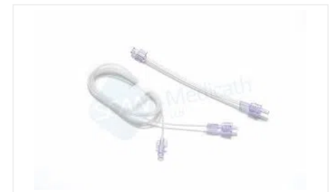
Normal Connecting Tubings