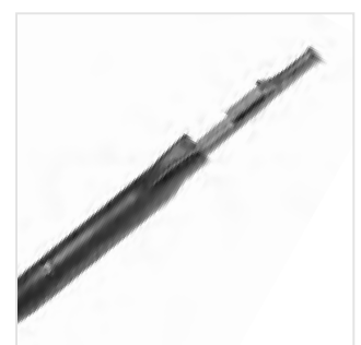
Compact ergonomical design