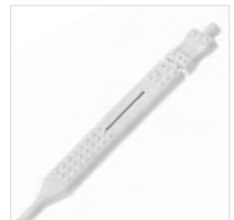
Ergonomical handle with defined breaking point