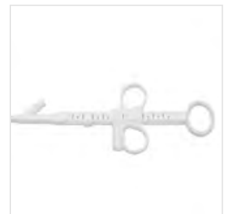
Highly mobile grip for precision insertion and extraction