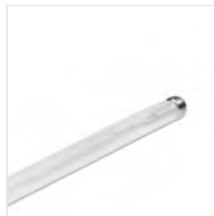
Atraumatic tip gentle to working channel and mucosa