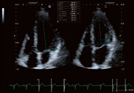
Auto EF measurement

A suite of automated measurement and analysis tools, such as Auto EF for the left ventricle or automated IMT measurement, helps you increase the accuracy, consistency and speed of your exams.