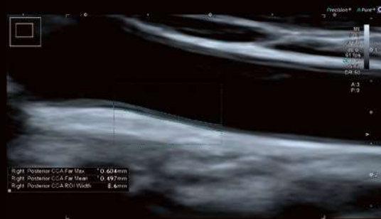
Automated IMT measurement