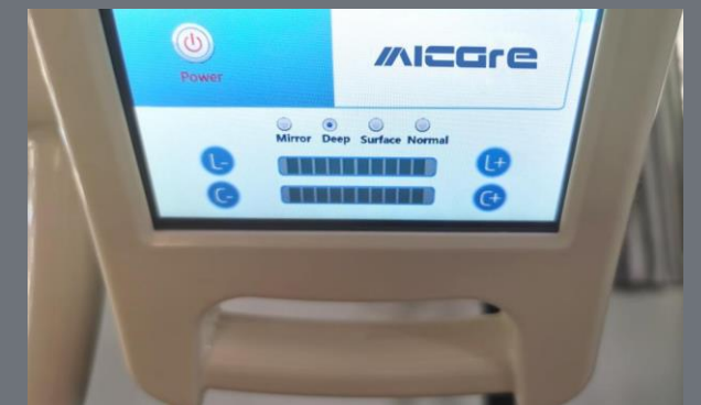
5.1 INCHES LCD Touch Panel Optional (OEM With LOGO Print Available)