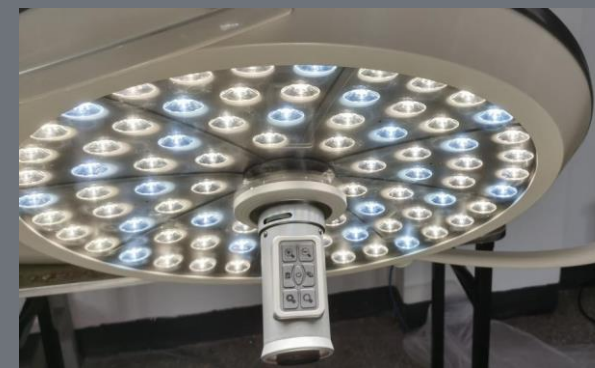
Removable Sterilizer Handle Can Be Easily Replaced by Internal Camera