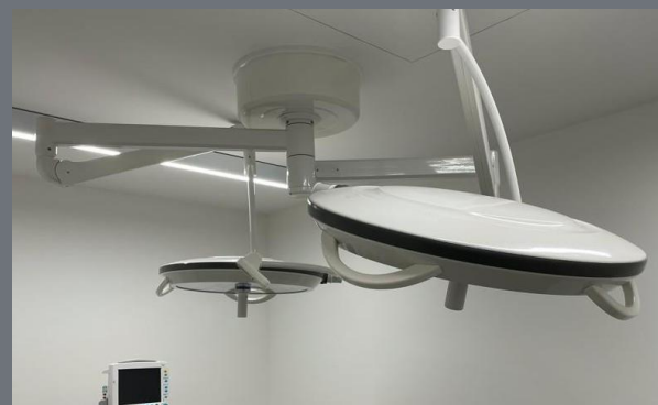
Astro Space Design, Working seamlessly with laminar airflow solutions