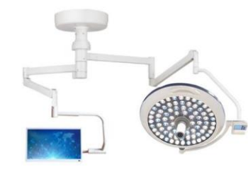
E700 Internal Camera