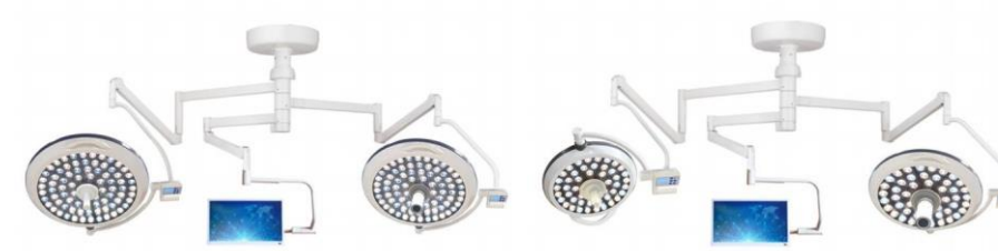
E700/700 Internal Camera