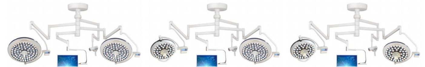
E700/700 External Camera