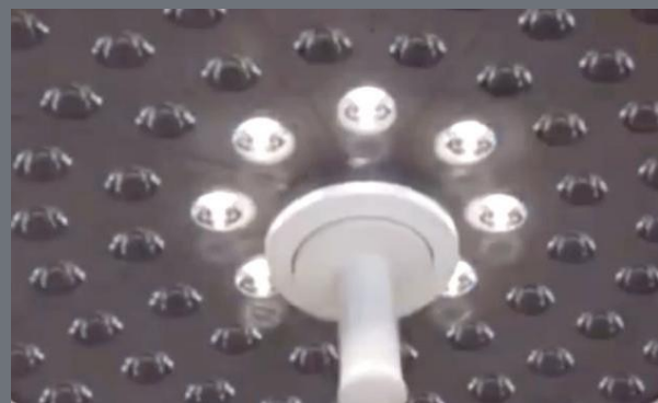
Endoscopy Mode In Deep Illumination For Various Operation Environments