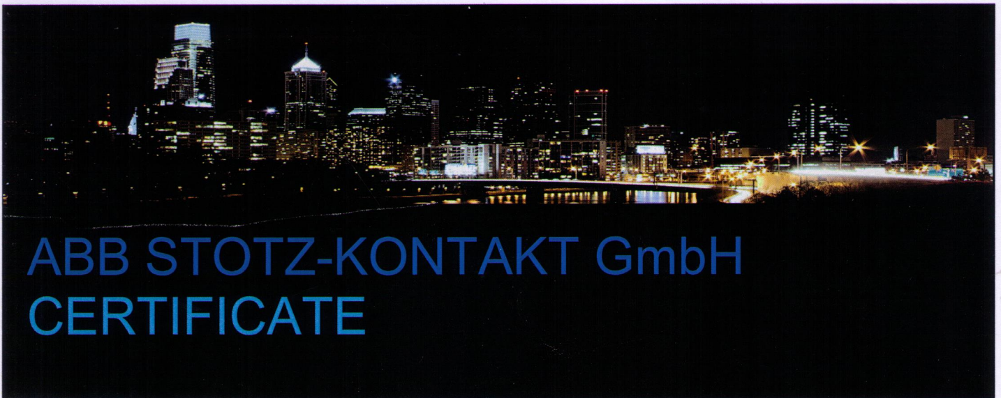
ABB STOTZ-KONTAKT GmbH CERTIFICATE