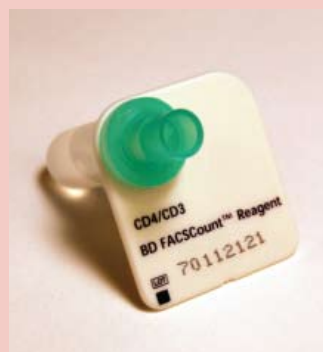
BD FACSCount CD4/CD3 Reagent Kit (Cat. No. 342512)

This reagent delivers absolute CD4 counts and CD4 percentages.