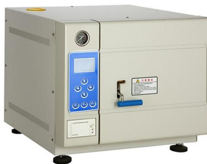
TABLE TOP STEAM STERILIZER (TM-35DV, TM-50DV)