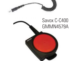
Savox C-C400 GMMN4579A

Complete the solution with the Savox C-C400 com-control unit that enables the use of your two-way radio in hazardous conditions. Designed to be especially robust for the most extreme environments, the extra-large push-to-talk button ensures transmission even when used underneath gear and protective clothing.