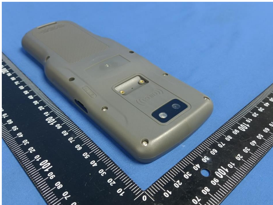
Figure 2 External view