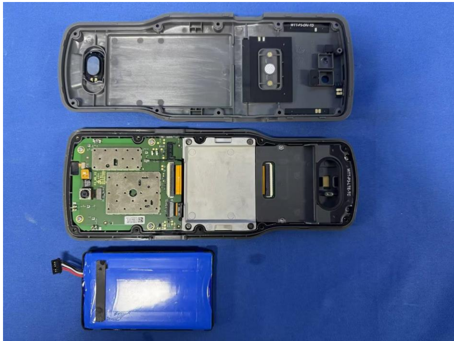
Figure 6 After Test