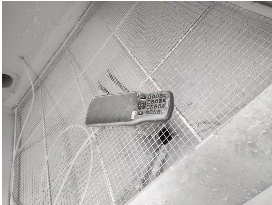
Figure 3 Test view