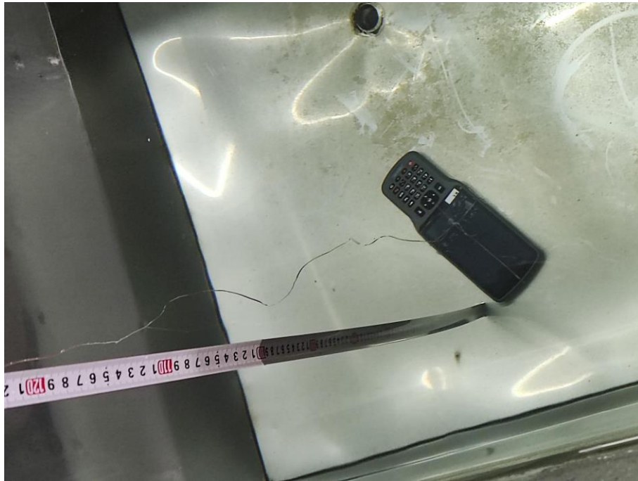
Figure 5 Test view