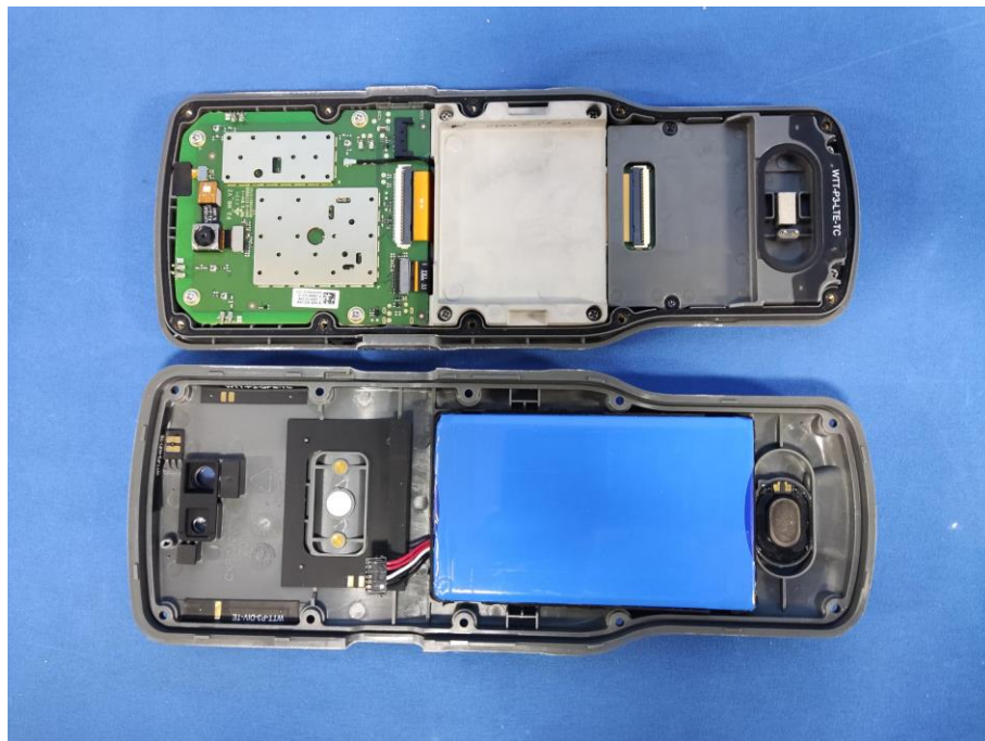
Figure 4 After Test