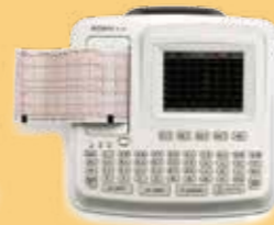
SE-601 Series Electrocardiograph