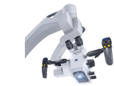
ZEISS TIVATO® 700