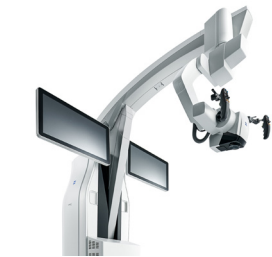
ZEISS KINEVO® 900