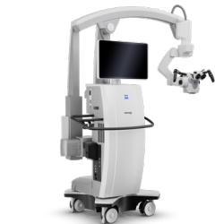
ZEISS PENTERO® 800 S