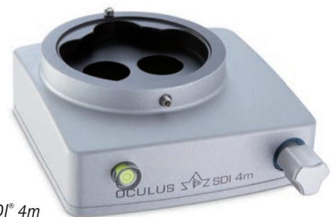
> SDI® 4m