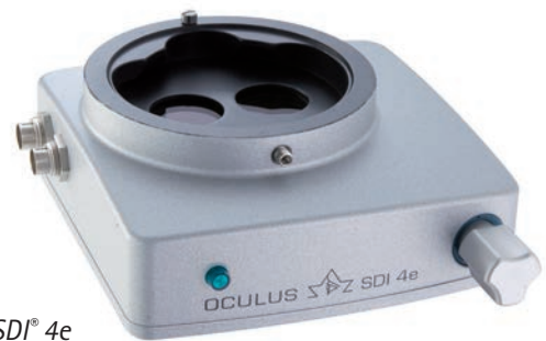
> SDI® 4e