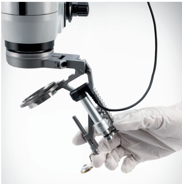
> Intelligent activation of the SDI® 4c