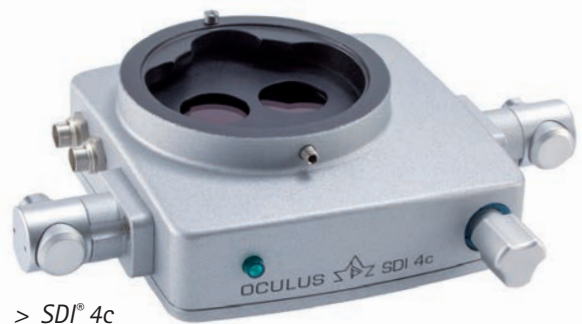
> SDI® 4c