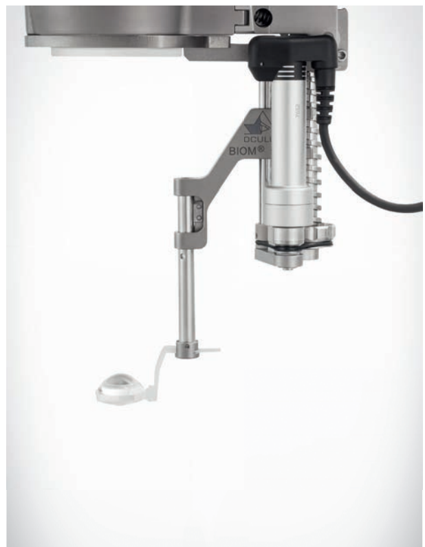
> BIOM® 5c in working position

When used with the SDI® 4c the BIOM® 5c offers the convenience of electronic foot pedal focusing and intelligent and automatic image inversion.