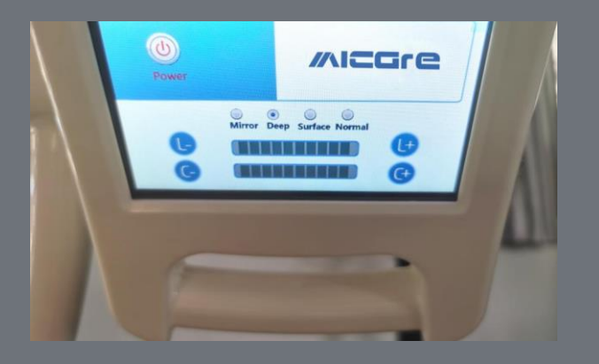
5.1 INCHES LCD Touch Panel Optional (OEM With LOGO Print Available)