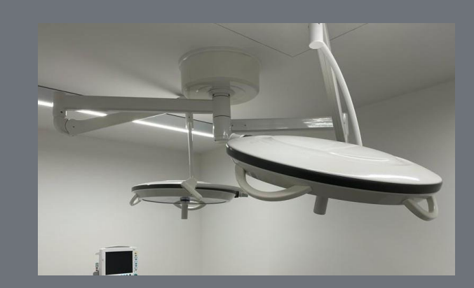
Astro Space Design, Working seamlessly with laminar airflow solutions