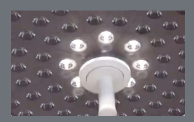
Endoscopy Mode In Deep Illumination For Various Operation Environments

Maximum illumination up to 180,000 lux Stable and constant illumination Enhanced visibility, diagnosis and treatment