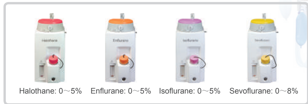
Halothane: 0~5% Enflurane: 0~5% Isoflurane: 0~5% Sevoflurane: 0~8%