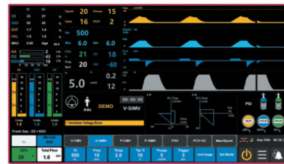
15.6" Touch screen display