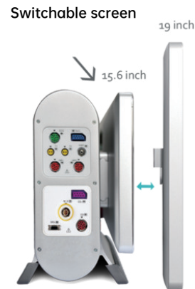
Multiple-parameter options & Flexible screen size options