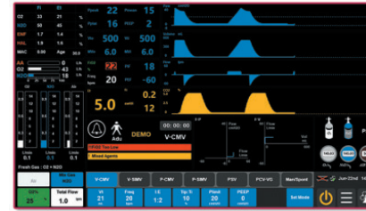
15.6" Touch screen display