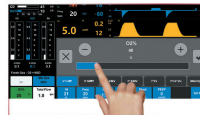
Auto FiO 2