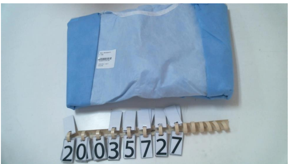
This report shall not be reproduced other than in full except with the permission of the laboratory. Testing reports without signature and seal are not valid.

REMARK: Original samples are kept for 3 months and all technical records are kept for 5 years unless otherwise specified. If requested, measurement uncertainty will be reported. But unless otherwise specified, measurement uncertainty is not considered while stating compliance with specification or limit values The reported uncertainty is based on a standard uncertainty multiplied by a coverage factor k=2, providing a level of confidence of approximately 95 %. Tests marked (*) in this report are not included in the accreditation schedule.