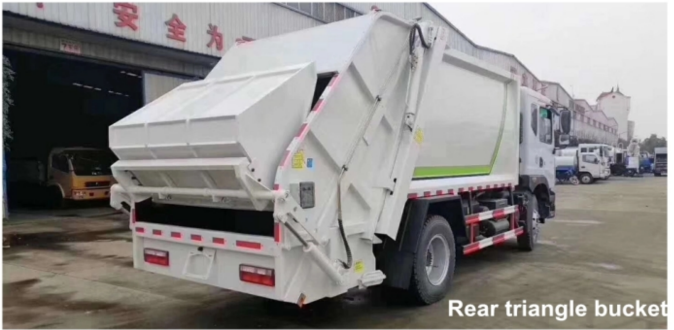
Rear triangle bucket