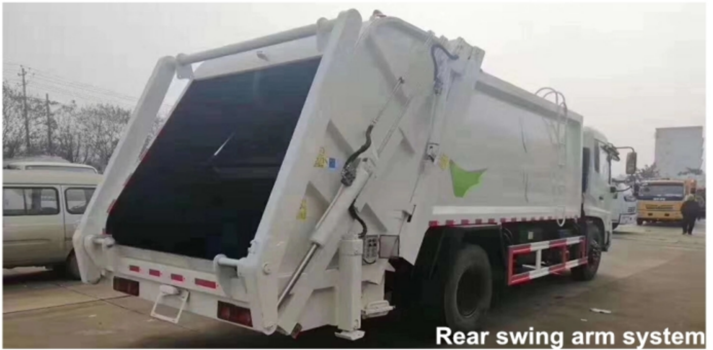
Rear swing arm system