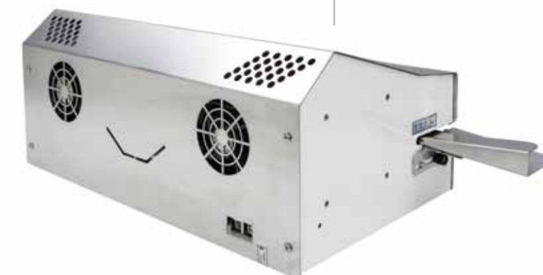
PLUSEAL RS20 & RS26 Difference Only in Connection Ports & Software

Thanks to its integrated printer with font adjustment, PLUSEAL RS20 & WRITEMATIC technology of PLUSEAL RS26, they are able to print: