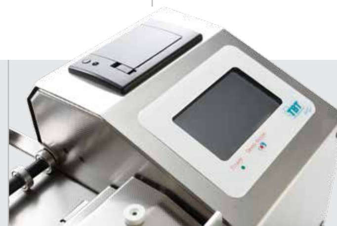
PLUSEAL RS36 with Integrated Printer