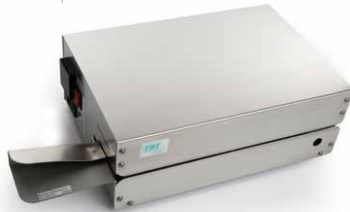
PLUSEAL RS14 with Automatic Stand-by and 14 m/min Packing Speed