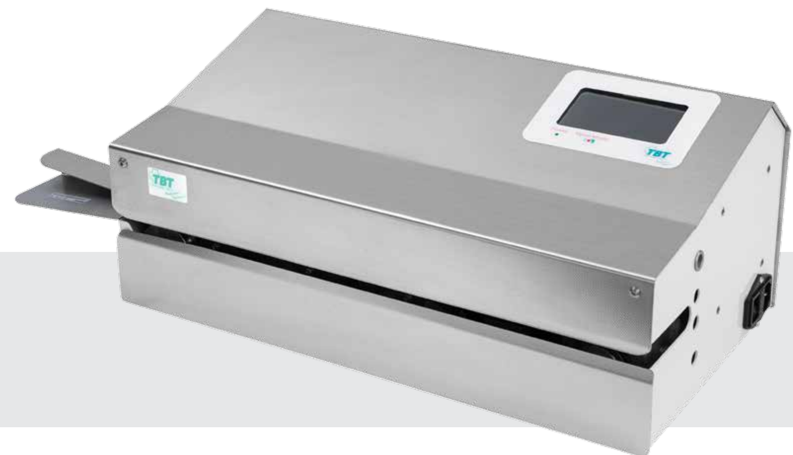
PLUSEAL RS20 & RS26 Twin Borthers

WRITEMATIC technology in PLUSEAL RS26 & PLUSEAL RS36 enables microprocessor to set font size and with in order to fit the pouch. Key specialties are for all models with a touch screen also include: