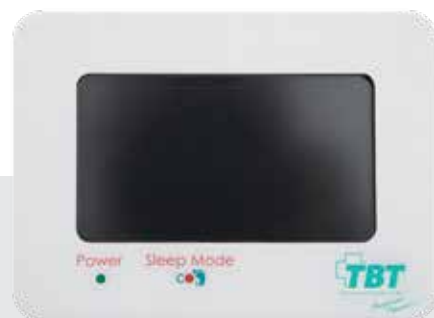
PLUSEAL RS 20, RS 26, RS30 & RS36 With 4.3" / 7" Colour LCD Touchscreen