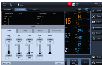
Automatic alarm limit

Benefit from the intuitive UI design of V3, it only takes two steps to adjust ventilation parameters. The functional layout is clinically applicable, and what you think is what you get.