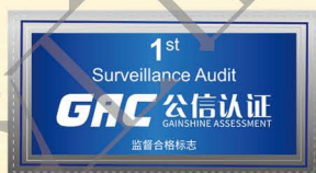
1 st Surveillance audit

This certificate will not be in force unless the annual label for surveillance qualified is stuck thereunder.