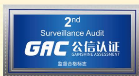
2 nd Surveillance audit