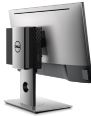
OPTIPLEX MICRO ALL-IN-ONE STAND

Small footprint mounting solution featuring integrated monitor power and Ethernet cables, as well as monitor adjustability with height, tilt, swivel and pivot functions.