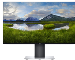
DELL ULTRASHARP 24 MONITOR - U2419H

23.8" ultrathin bezel optimized for dual display productivity. Easy Arrange feature enables multitasking efficiency and its small base frees valuable workspace.