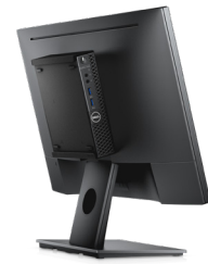
OPTIPLEX MICRO ALL-IN-ONE MOUNT FOR DELL E SERIES MONITORS

Small footprint mounting solution adapts to your environment, with cable management and monitor height adjustability, tilt, swivel and pivot functions.