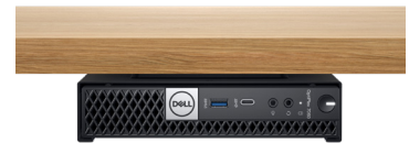
OPTIPLEX MICRO VESA MOUNT

Mount your system on a wall or under a surface with full optical drive access. Includes an adapter box to securely house the system's power adapter.