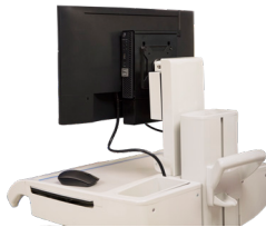
OPTIPLEX MICRO DUAL VESA MOUNT

This mount allows the Micro to be VESA mounted to select Dell E Series displays.