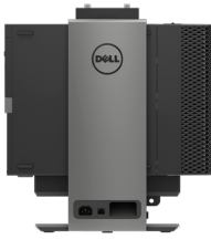
OPTIPLEX SMALL FORM FACTOR ALL-IN-ONE STAND

Small footprint mounting solution featuring integrated monitor power and Ethernet cables, as well as monitor adjustability with height, tilt, swivel and pivot functions.