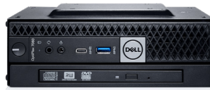
OPTIPLEX MICRO DVD+/-RW ENCLOSURE

Mount your system between two VESA compatible devices. Includes an adapter box to securely house the system's power adapter.