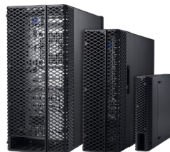
OPTIPLEX CABLE COVERS

Communicate clearly with a headset optimized to provide in-person sound quality, certified for Microsoft Skype for Business.