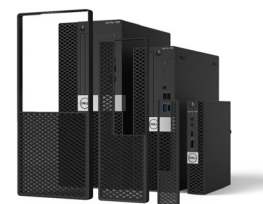
OPTIPLEX DUST FILTERS

Thermally tested custom cable covers offer an easy to install and attractive way to manage cables and secure ports.