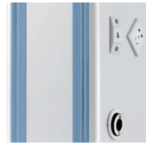
Built-in rails, more hygienic