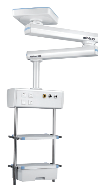
Surgical Pendant with double arms, head version