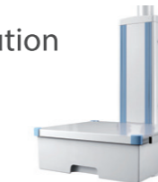
Distribution column height: 800mm, 1000mm