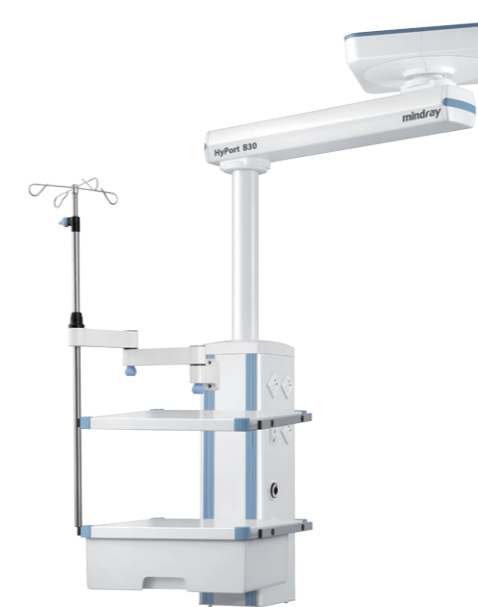
ICU Pendant with single arm, column version