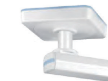
Long base, height: 400mm