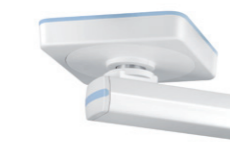
Short base, height: 200mm