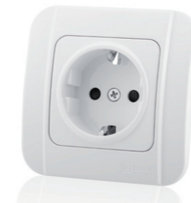
More options for electric outlets