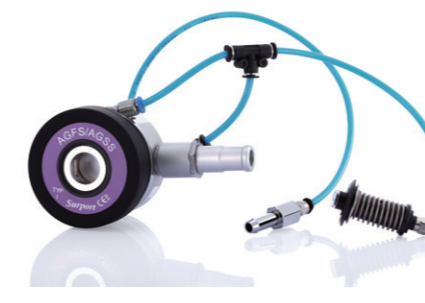
More options for gas outlets