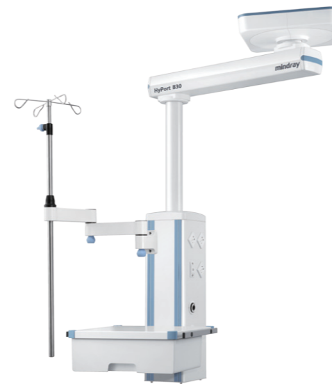
Anesthesia Pendant with single arm, column version