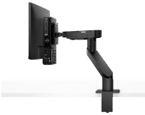
DELL SINGLE MONITOR ARM - MSA20

Maximize your desk space with this sleek arm that supports both system and monitor mounting.