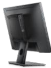
OPTIPLEX MICRO ALL-IN-ONE MOUNT FOR DELL E SERIES MONITORS

Maximize your desk space with this sleek arm that supports both system and monitor mounting.