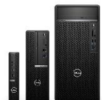
OPTIPLEX DUST FILTERS

Thermally tested custom cable covers offer an easy to install and attractive way to manage cables and secure ports.