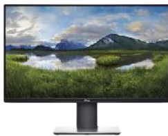
DELL 24 MONITOR - P2419H

23.8" ultrathin bezel optimized for dual display productivity. Easy Arrange feature enables multitasking efficiency and its small base frees valuable workspace.