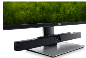
DELL PROFESSIONAL SOUND BAR - AE515M

Optimize your workspace with this efficient 21.5" monitor built with an ultrathin bezel, a small footprint and comfort-enhancing features.