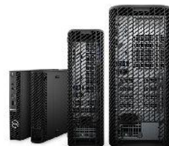
OPTIPLEX CABLE COVERS

Communicate clearly with a headset optimized to provide in-person sound quality, certified for Microsoft Skype for Business.