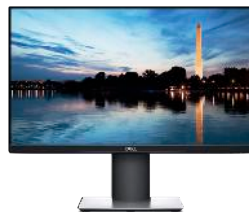
DELL 22 MONITOR - P2219H

23.8" ultrathin bezel optimized for dual display productivity. Easy Arrange feature enables multitasking efficiency and its small base frees valuable workspace.