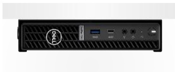
OPTIPLEX MICRO VESA MOUNT WITH ADAPTER BRACKET

Mount your system on a wall or under a surface with a VESA-compatible DVD+/-RW enclosure with full optical drive access. Includes an adapter box to securely house the system's power adapter.