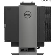
OPTIPLEX SMALL FORM FACTOR ALL-IN-ONE STAND (COMING SOON)

Small footprint mounting solution adapts to your environment, with cable management and monitor height adjustability, tilt, swivel and pivot functions.