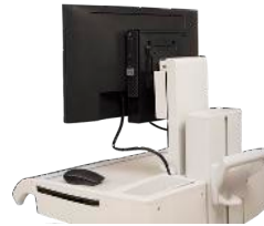
OPTIPLEX MICRO DUAL VESA MOUNT WITH ADAPTER BRACKET

This mount allows the Micro to be VESA mounted to select Dell E Series displays.