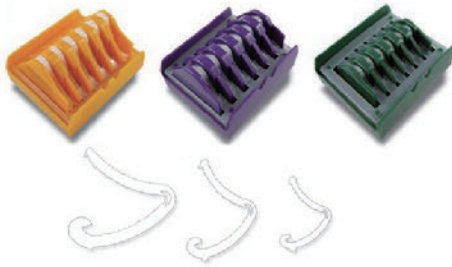
Disposable Ligating Clips