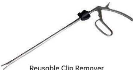
Reusable Clip Remover