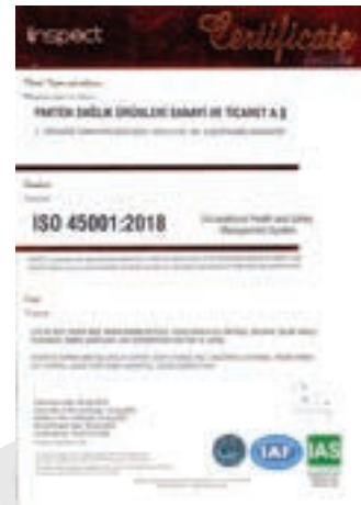
Occupational Health & Safety Management System ISO 45001 - 2018