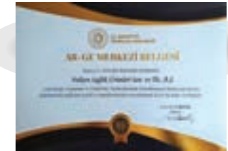
R&D Center Certification