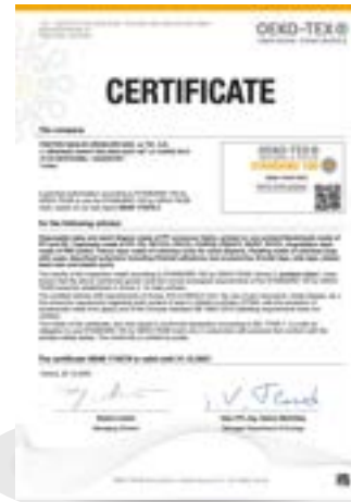
Oeko-Tex® Confidence in textiles