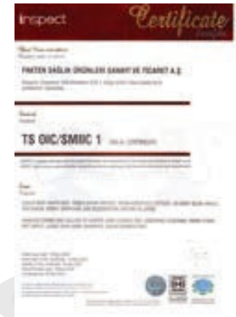
Halal Certificate TS OIC/SMIIC 1