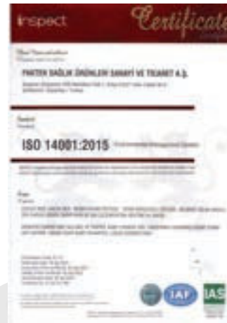
Environmental Management System ISO 14001 - 2015