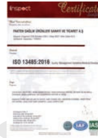
Quality Management System for Medical Devices ISO 13485 - 2016