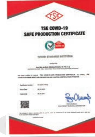
TSE COVID-19 Safe Production Certificate