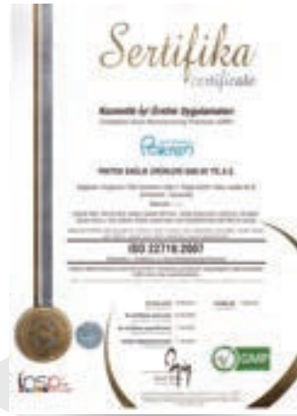
GMP Good Manufacturing Practices ISO 22716:2007