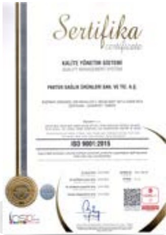
Quality Management System TS EN ISO 9001:2015 IQNET