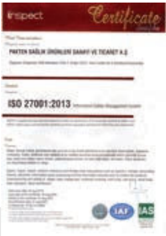
Information Security Management System ISO 27001