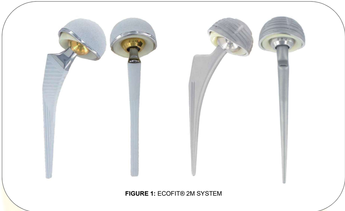
FIGURE 1: ECOFIT® 2M SYSTEM