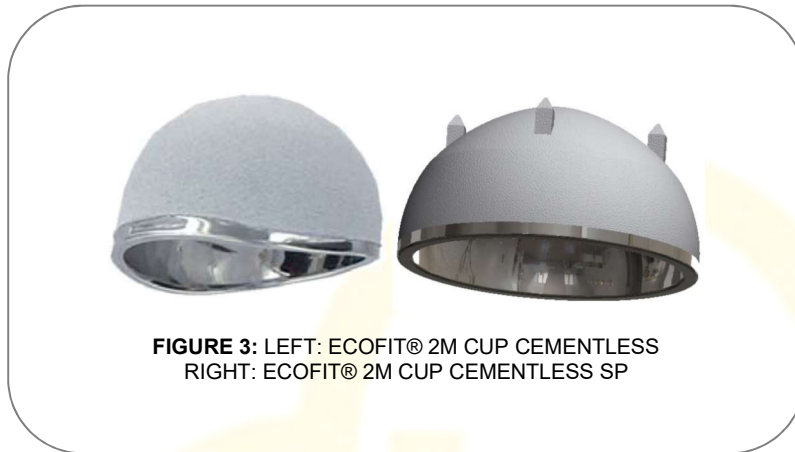
FIGURE 3: LEFT: ECOFIT® 2M CUP CEMENTLESS RIGHT: ECOFIT® 2M CUP CEMENTLESS SP

The cementless acetabular cups serve as a replacement for a diseased acetabulum. It articulates with a 2M implacross® E head or EcoFit® 2M head to build a dual mobility hip arthroplasty. The cups are made of implavit®, CoCrMo-casting alloy.