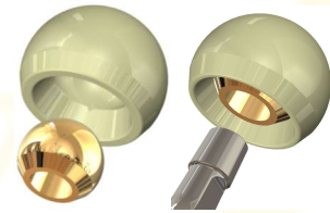
FIGURE 6: COMBINATION OF THE IC-HEAD AND THE ECOFIT® 2M HEAD RESP. 2M IMPLACROSS® E HEAD

The 2M implacross® E heads and the EcoFit® 2M heads mate with metal shells having an outer diameter corresponding to the inner diameter of the EcoFit® 2M Acetabular Cup. The compatible 2M implacross® E heads resp. the EcoFit® 2M head and metal shells are listed in the following table.