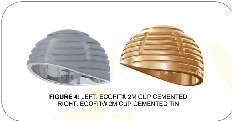
FIGURE 4: LEFT: ECOFIT® 2M CUP CEMENTED RIGHT: ECOFIT® 2M CUP CEMENTED TiN

The cemented acetabular cups serve as a replacement for a diseased acetabulum. It articulates with the 2M implacross® E head resp. EcoFit® 2M head to build a dual mobility hip arthroplasty. The EcoFit® 2M acetabular cups are used with bone cement.