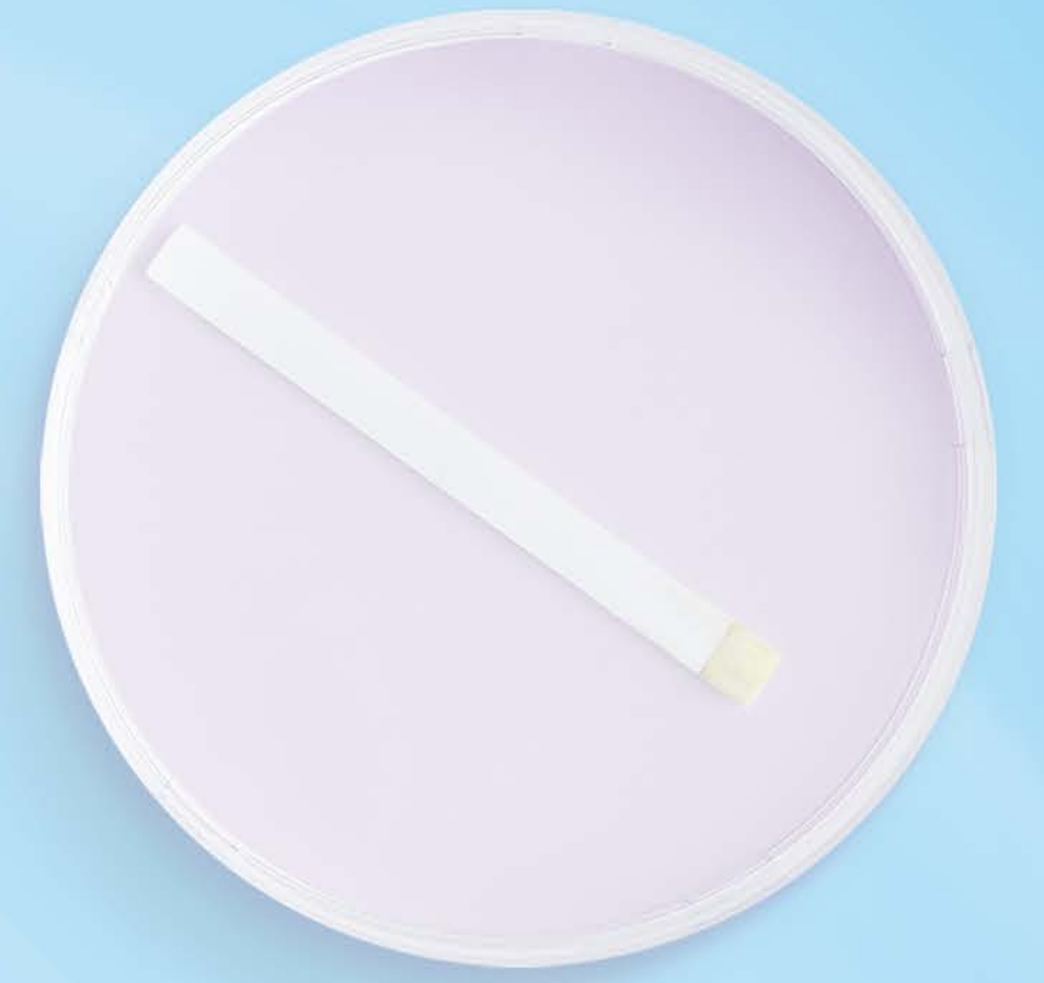
PYR - NEGATIVE