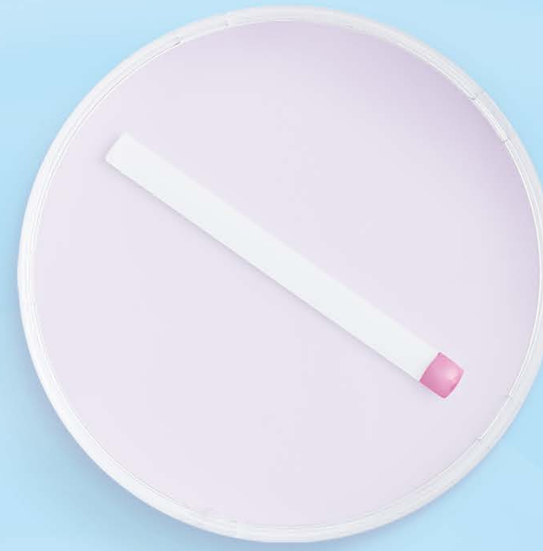
PYR - POSITIVE