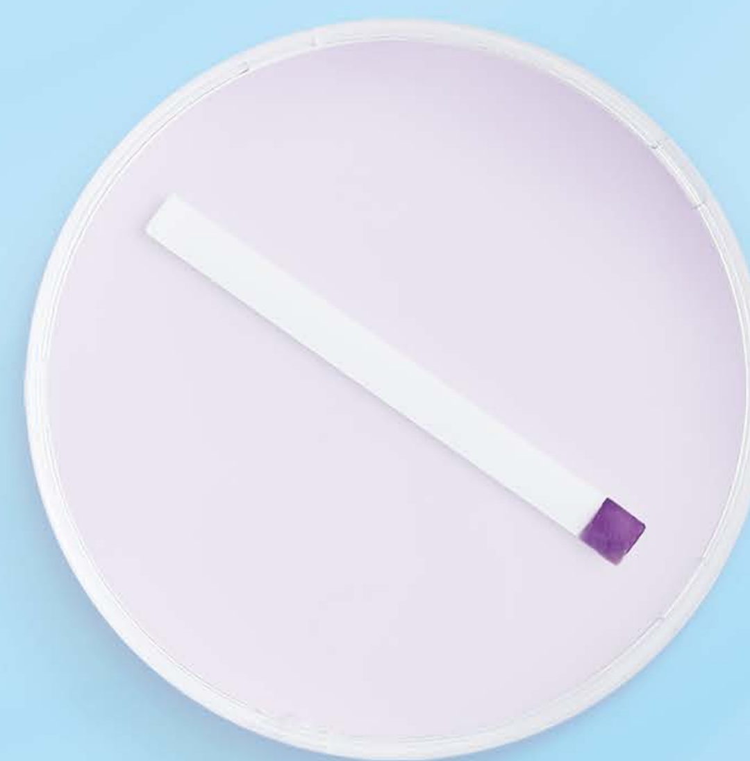
OXIDASE - POSITIVE