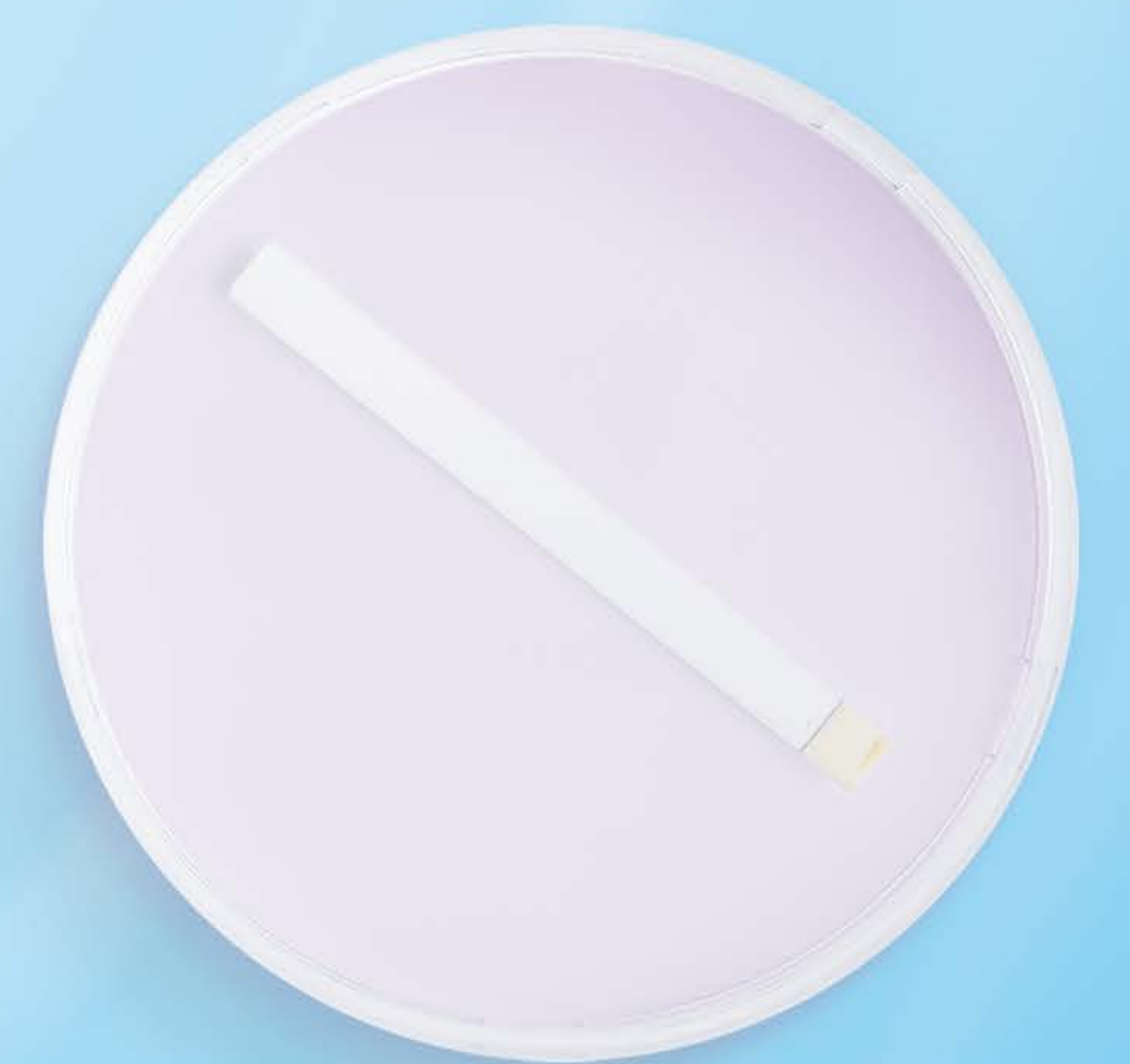
OXIDASE - NEGATIVE