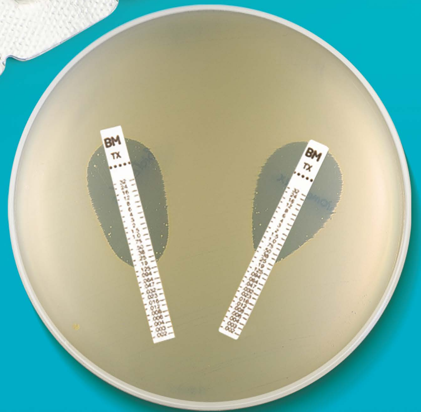
Ceftriaxone E.coli ATCC 25922