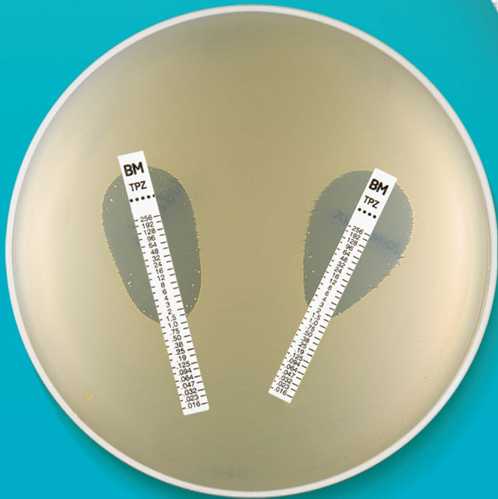
Piperacillin / Tazobactam S. Aureus ATCC 29213