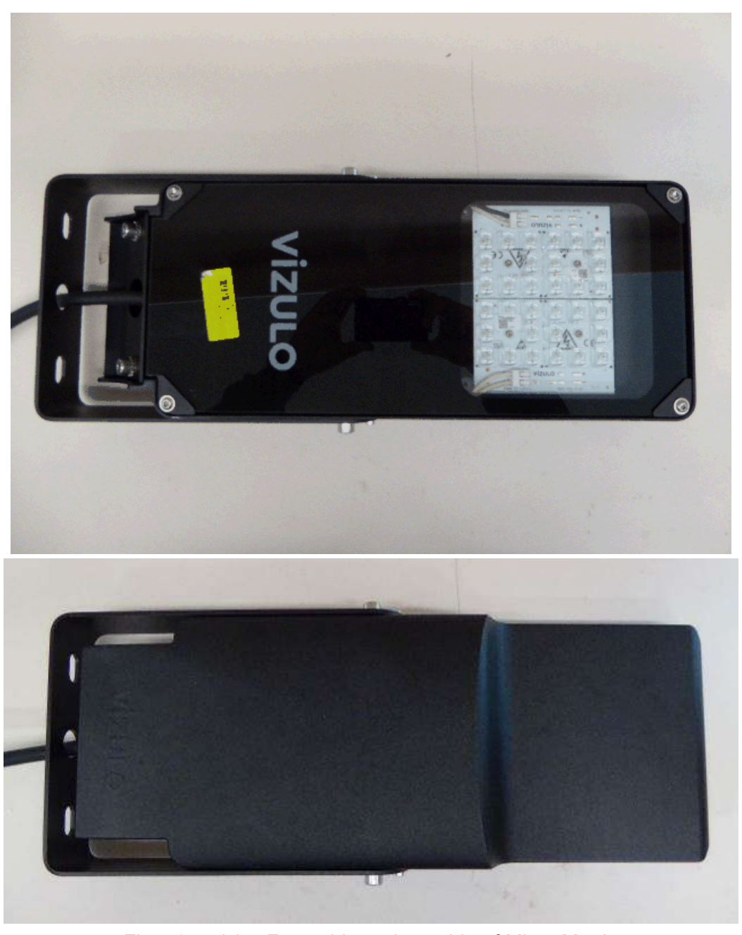
Figs. 1 and 2 – Front side and top side of Micro Martin