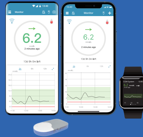
EasySense App (iOS & Android)