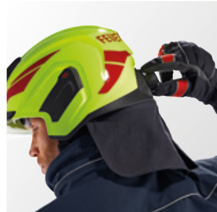
User friendly rotary knob