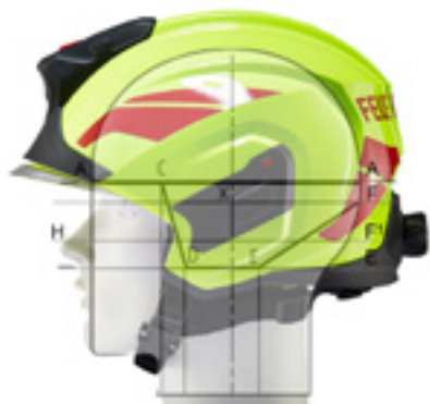
HEROS-titan: full shell