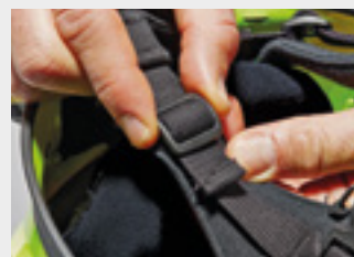
Chin strap padding