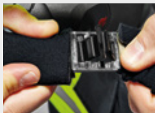
Headbands in three widths