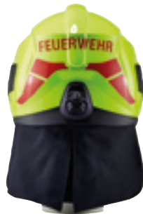
157364 / 157394