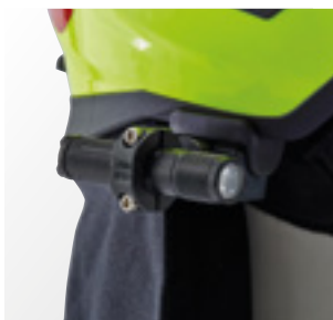
15736301/15736305 (without lamp)