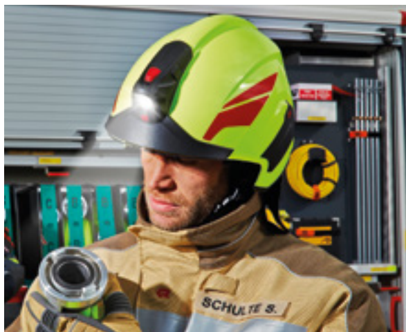
Most powerful helmet torch