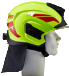
157364 / 157394