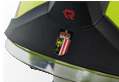
Helmet crests upon request.