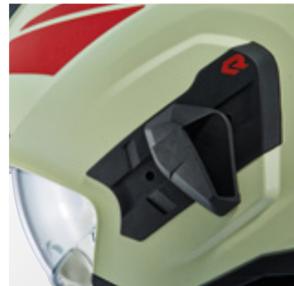
Fully flexible mask adapter