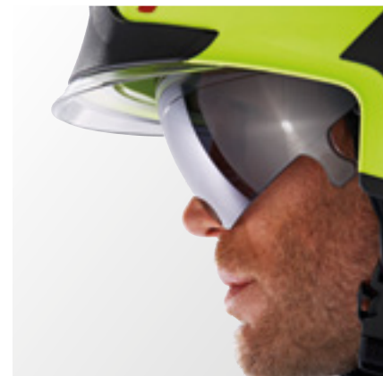
Face shield and eye protection visors according to optical class 1