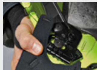
Optimised centre of gravity