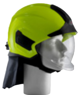
157302 / 157312