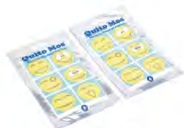
SF21 - Mosquito Repellent Patch Size: ø27mm, ø30mm, ø38mm, etc. Color: yellow, blue, white. Material: non-woven + mosquito natural plant extracts, polymer gel, etc.