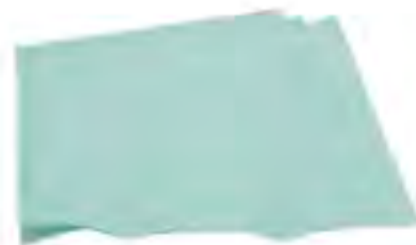
SL05 - Wrapping Crepe Paper Size: 30 x 30cm, 40 x 40cm, 45 x 45cm, 50 x 50cm, 60 x 60cm, 75 x 75cm, 90 x 90cm, 100 x 100cm, 120 x 120cm, etc. Color: blue, green, white, etc. Material: 100% wood pulp.