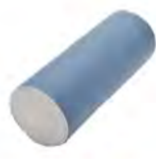
SH03 - Interleaved Cotton Wool Size: 400g, 454g, 500g, etc. Color: bleached white. Material: 100% cotton.