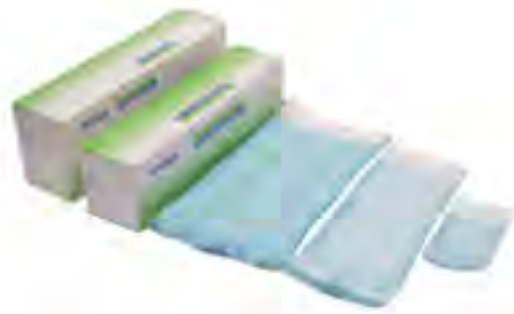
SL01 - Self-sealing Sterilization Pouch Size: 57 x 130mm, 70 x 260mm, 90 x 165mm, 90 x 260mm, 135 x 260mm, 135 x 280mm, 190 x 360mm, 200 x 360mm, 230 x 395mm, 300 x 395mm, etc. Color: blue, green. Material: medical grade paper + PET/PP film + medical adhesive tape.