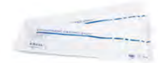
SB03 - Orthopedic Splint Size: 7.5cm x 30cm, 7.5cm x 90cm, 10cm x 40cm, 10cm x 75cm, 12.5cm x 75cm, 12.5cm x 115cm, 15cm x 75cm, 15cm x 115cm. Color: white. Type: i) fiberglass; ii) polyester.