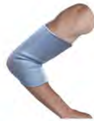
SM0103 - Elbow Support (polyester) Size: S, M, L, XL. Material: polyester + latex.