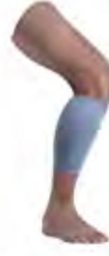
SM0106 - Shin Support (polyester) Size: S, M, L, XL. Material: polyester + latex.