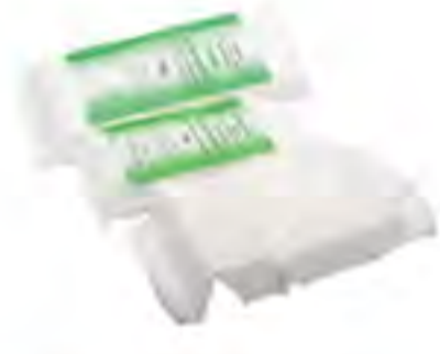
SH05 - Zig-zag Cotton Wool Size: 25g, 35g, 50g, 100g, 200g, 250g, 500g, 1000g, etc. Color: bleached white. Material: 100% cotton.