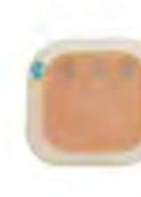
SF14 - Hydrocolloid Dressing with Silver Size: 5x5cm, 10x10cm, 15x15cm, etc. Material: pressure sensitive adhesive + CMC + silver ion.