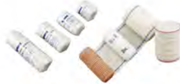
SA02 - Spandex Crepe Bandage Size: 5cm x 4.5m, 7.5cm x 4.5m, 10cm x 4.5m, 15cm x 4.5m. Weight: 65g/m 2 , 70g/m 2 , 75g/m 2 . Color: natural white, bleached white, skin. Material: cotton + spandex.