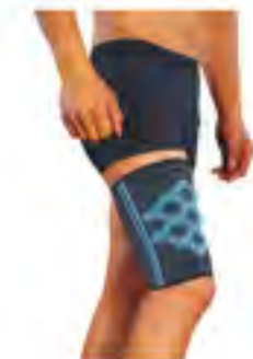
SM0306 - Thigh Support (pattern nylon) Size: S, M, L, XL. Material: nylon + latex + spandex.