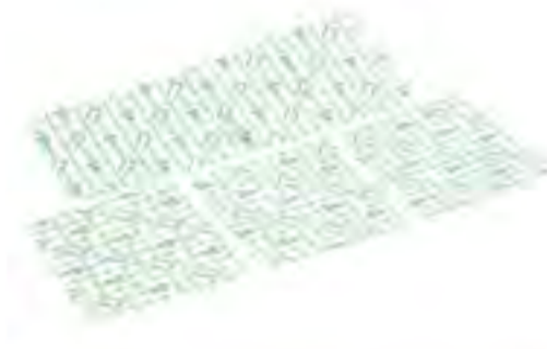
SE16 - PU Wound Dressing (without absorbent pad) Size: 4x5cm, 6x7cm, 9x10cm, 10x12cm, 10x14cm, 10x20cm, etc. Color: transparent. Material: PU film + glue.