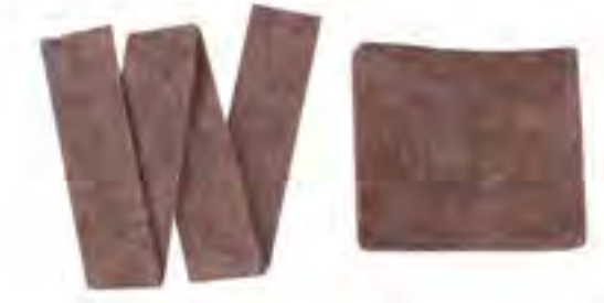
SF10 - Alginate Dressing with silver Size: 5x5cm, 10x10cm, 10x15cm, 10x20cm, 15x20cm, 2x30cm, etc. Material: alginate fiber + calcium ion + silver ion.