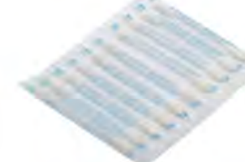
SI13 - Filling Alcohol Swabstick Size: ø5mm x 3". Packaging: 100pcs/bundle.