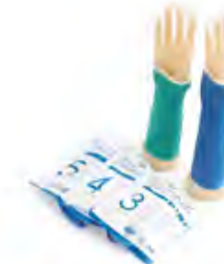
SB02 - Orthopedic Casting Tape Size: 5cm x 3.6m, 7.5cm x 3.6m, 10cm x 3.6m, 12.5cm x 3.6m, 15cm x 3.6m. Color: white, blue, green, pink, red, yellow, orange, etc. Type: i) fiberglass; ii) polyester.