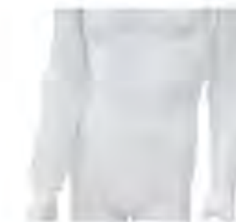
SJ31 - Non-woven Sleeve Cover Size: 40 x 20cm, 46 x 22cm, 48 x 25cm, etc. Color: blue, green, white, pink, etc. Material: PP non-woven. Weight: 25g/m 2 , 30g/m 2 , 35g/m 2 , etc.