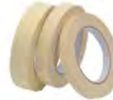
SL07 - Autoclave Tape (Steam Sterilization Indicator Tape) Size: 12mm x 50m, 19mm x 50m, 25mm x 50m, etc. Color Change: from Yellow to Black. Material: paper + steam sterilization indicator ink.