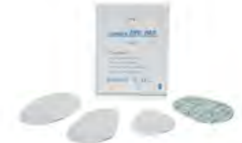
SE22 - Adhesive Eye Pad Size: 80x58mm, 95x65mm, etc. Color: white. Material: non-woven + glue.