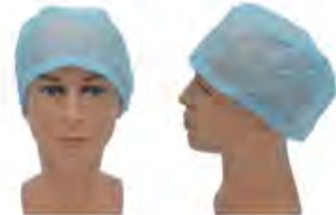
SJ04 - Doctor Cap (Surgeon Cap) - Elastic Type Size: 64x13cm, etc. Color: blue, green, etc. Material: PP non-woven. Weight: 20 - 30 gm 2 .