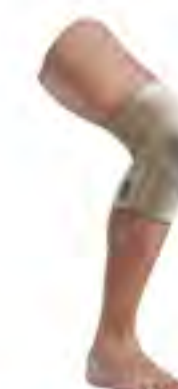
SM0204 - Knee Support with Metal Sping (skin nylon) Size: S, M, L, XL. Material: nylon + latex + spandex + metal sping.