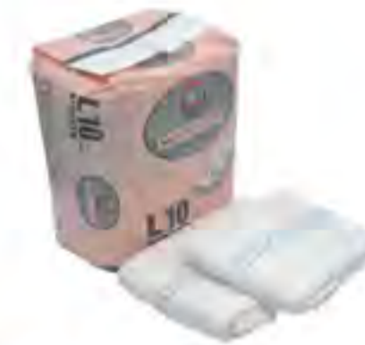
SK07 - Adult Diaper Size: 800 x 650mm(M), 900 x 750mm(L), 980 x 800mm(XL), etc. Color: white, etc. Material: PE + non-woven + fluff pulp + SAP, etc. Weight: 90 - 120 g/pc. Type: with or without leg cuff, with or without wetness indicator.