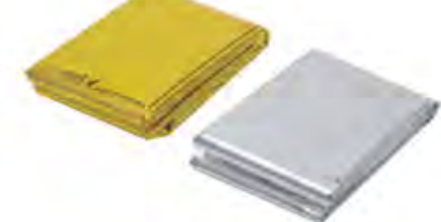
SG26 - Emergency Blanket Size: 160x210cm, 135x200cm, etc. Color: gold, silver, gold+silver. Material: aluminum foil.