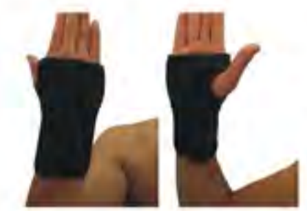
SM0805 - Wrist Support with Aluminium Alloy Holder Size: one size fits all. Material: nylon + polyester + neoprene + aluminium alloy holder.