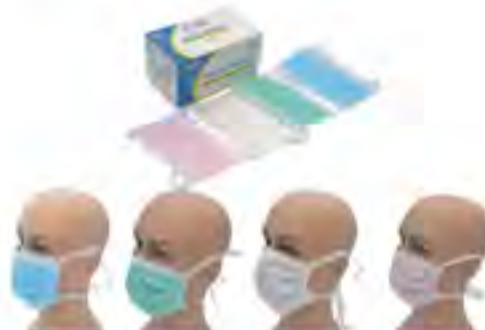
SJ06 - Non-woven Face Mask (Ties Type) Size: 17.5 x 9.5cm. Ply: 2ply, 3ply. Color: green, blue, white, pink, etc. Material: PP non-woven + meltblown fabric. Weight: 18+20+25 gm 2 , etc.