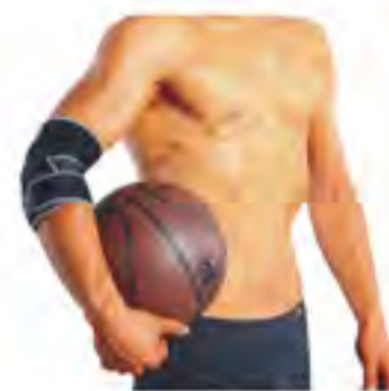
SM0503 - Elbow Support (neoprene) Size: one size fits all. Material: neoprene + nylon + spandex.