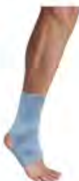
SM0107 - Ankle Support (polyester) Size: S, M, L, XL. Material: polyester + latex.