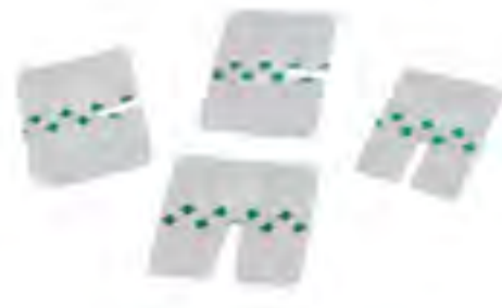
SE19 - PU I.V. Dressing Size: 6x7cm, 6x8cm. Color: transparent. Material: PU film + glue.