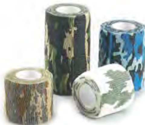
SC06 - Cohesive Elastic Bandage (Camouflage Type) Size: 2.5cm x 4.5m, 5cm x 4.5m, 7.5cm x 4.5m, 10cm x 4.5m, 15cm x 4.5m. Color: camouflage pattern. Material: non-woven + elastic yarn + glue.