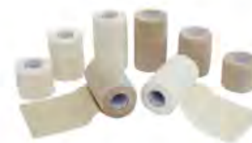
SC10 - Elastic Adhesive Bandage (EAB) Size: 5cm x 4.5m, 7.5cm x 4.5m, 10cm x 4.5m. Color: white, skin. Material: cotton + glue.