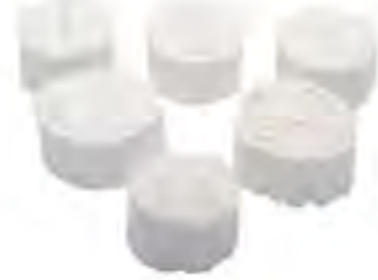
SH08 - Dental Cotton Roll Size: ø0.8cm x 3.8cm, ø1.0cm x 3.8cm, ø1.2cm x 3.8cm. Color: bleached white. Material: 100% cotton.