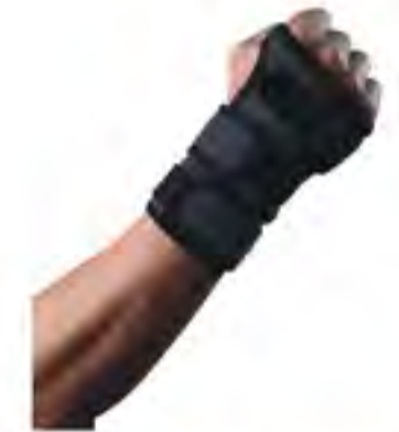
SM0802 - Wrist Support with Aluminium Alloy Holder Size: one size fits all. Material: nylon + foam + polyester + neoprene + aluminium alloy holder.