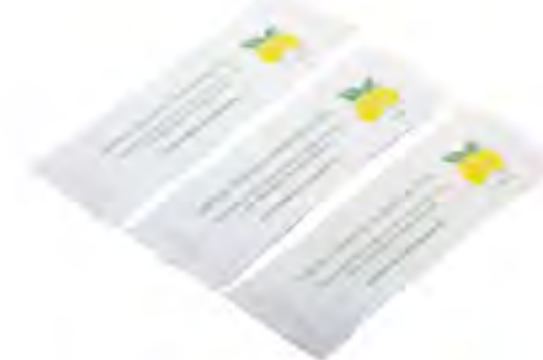
SI12 - Lemon Glycerine Swabstick Size: ø10mm x 4". Packaging: 1pc/pouch, 2pcs/pouch, 3pcs/pouch.