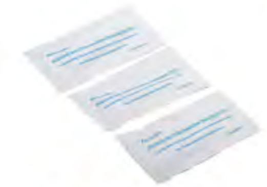
SI11 - Alcohol + Chg Swabstick Size: ø10mm x 4". Packaging: 1pc/pouch, 2pcs/pouch, 3pcs/pouch.