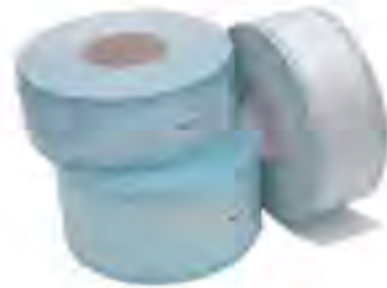
SL03 - Flat Sterilization Roll Size: 50mm x 200m, 55mm x 200m, 75mm x 200m, 100mm x 200m, 150mm x 200m, 200mm x 200m, 250mm x 200m, 300mm x 200m, 350mm x 200m, 400mm x 200m, 450mm x 400m, etc. Color: blue, green. Material: medical grade paper + PET/PP film.