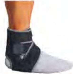
SM0515 - Ankle Support with Metal Spring (neoprene) Size: one size fits all. Material: neoprene + nylon + metal spring.