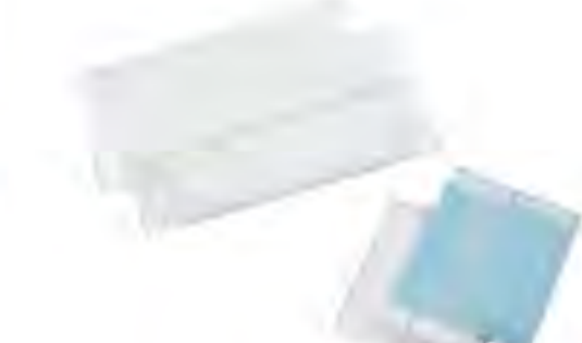
SG18 - Non-woven Abdominal Pad Size: 10x10cm, 10x20cm, 13x23cm, 20x20cm, 20x30cm, 20x40cm, etc. Color: white, blue, green. Material: non-woven + wood pulp. Type: non-sterile or sterile.