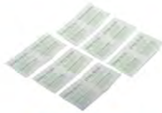
SI03 - Sting Relief Medicated Pad Size: 30x60mm-2ply, etc.