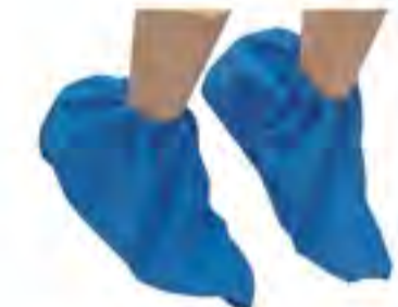
SJ30 - CPE Boot Cover Size: 24 x 38cm, 38 x 40cm, 40 x 50cm, etc. Color: blue, green, white, etc. Material: CPE. Weight: 10 - 30 g/pc.