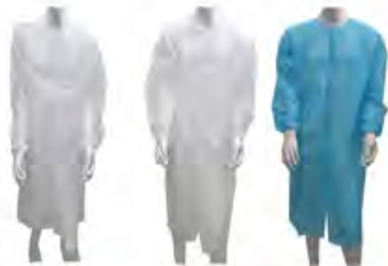
SJ19 - Lab Coat Size: 110 x 130cm(S), 115 x 137cm(M), 120 x 140cm(L), 125 x 145cm(XL), 130 x 150cm(XXL), etc. Color: white, blue, green, yellow, etc. Material: PP non-woven. Weight: 30g/m 2 , 35g/m 2 , 40g/m 2 , etc.