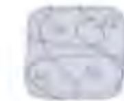
SF12 - Foam Silver Ion Dressing Size: 5x5cm, 10x10cm, 10x20cm, 15x15cm, 20x20cm, etc. Material: polyurethane + silver ion.