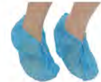
SJ27 - Non-woven Shoe Cover (manual) Size: 17 x 40cm, 17 x 45cm, 18 x 42cm, 18 x 45cm, 19 x 46cm, etc. Color: green, blue, white, pink, etc. Material: PP non-woven. Weight: 35g/m 2 , 40g/m 2 , etc. Type: normal, anti-skid.