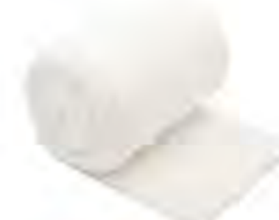
SG19 - Gauze Abdominal Roll Width: 10cm, 15cm, 20cm, etc. Length: 1m, 1.5m, 2m, etc. Color: bleached white. Material: 100% cotton.