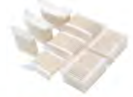
SH12 - Paper Cotton Swabs Material: paper stick + cotton tip. Size: 100pcs, 200pcs, 300pcs, etc. Packaging: PE bag, square box, etc.