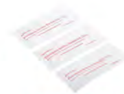
SI10 - Povidone-iodine Swabstick Size: ø10mm x 4". Packaging: 1pc/pouch, 2pcs/pouch, 3pcs/pouch.