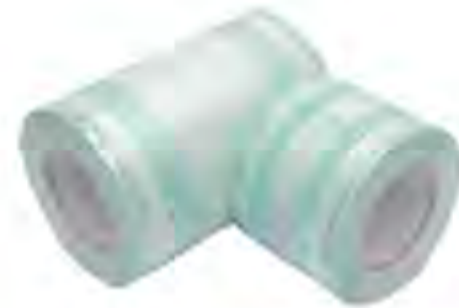
SL04 - Gusseted Sterilization Roll Size: 75mm x 100m x 25mm, 100mm x 100m x 50mm, 150mm x 100m x 55mm, 200mm x 100m x 65mm, 250mm x 100m x 70mm, 300mm x 100m x 80mm, 350mm x 100m x 80mm, 400mm x 100m x 100mm, etc. Color: blue, green. Material: medical grade paper + PET/PP film.