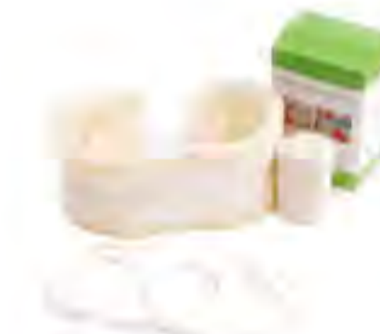
SB07 - Skin Traction Kit Size: adult, child. Color: natural white. Type: i) adhesive; ii) non-adhesive.