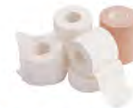
SC11 - Elastic Adhesive Bandage (cutting edge) Size: 2.5cm x 4.5m, 5cm x 4.5m, 7.5cm x 4.5m, 10cm x 4.5m. Color: white, skin. Material: cotton + glue.