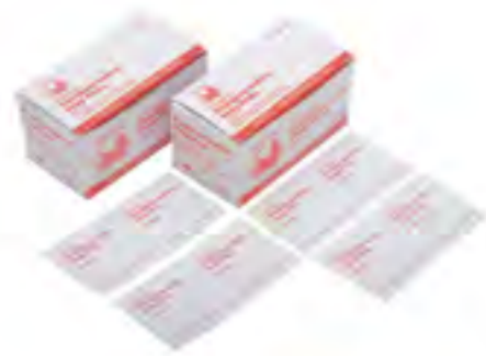
SI02 - Povidone-iodine Pad Size: 30x60mm-2ply, 60x60mm-4ply, etc.