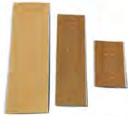
SE11 - Elastic Fabric Dressing Plaster Width: 4cm, 6cm, 8cm, etc. Length: 10cm, 25cm, 50cm, 100cm, 500cm, etc. Color: skin, white. Material: elastic fabric + glue.