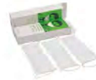
SJ09 - Paper Face Mask Size: 19 x 7cm. Ply: 1ply, 2ply. Color: white. Material: paper.