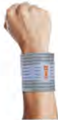
SM0601 - Wrist Wrap Size: one size fits all. Material: polyester + latex.