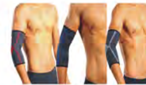
SM0302 - Elbow Support (pattern nylon) Size: S, M, L, XL. Material: nylon + latex + spandex.