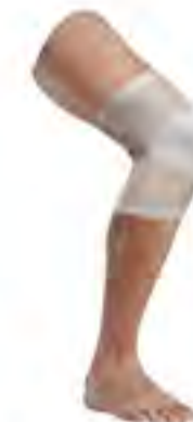
SM0203 - Knee Support (skin nylon) Size: S, M, L, XL. Material: nylon + latex + spandex.