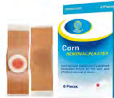
SF22 - Corn Plaster Size: 66x16mm, etc. Color: skin. Material: PE + glue.