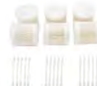
SH14 - Cosmetic Cotton Swabs Type: plastic stick; paper stick. Size: 200pcs. Packaging: round box.