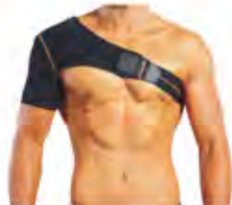
SM0807 - Shoulder Support Size: S, M, L, XL. Material: nylon + spandex + latex.