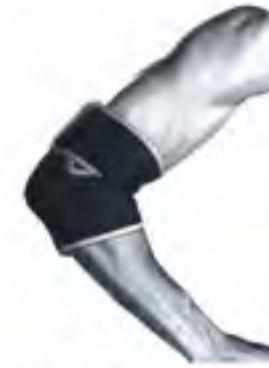
SM0504 - Elbow Support (neoprene) Size: one size fits all. Material: neoprene + nylon.