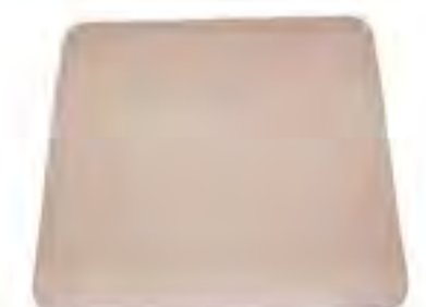
SF15 - Silicone Foam Dressing Size: 5x5cm, 10x10cm, 12.5x12.5cm, 15x15cm, 15x20cm, 10x17.5cm, 15x18cm, etc. Material: polyurethane + silicone gel + PU film.