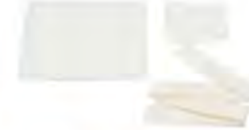
SF09 - Alginate Dressing Size: 5x5cm, 10x10cm, 10x15cm, 10x20cm, 15x20cm, 2x30cm, etc. Material: alginate fiber + calcium ion.