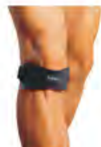
SM0808 - Magnet Patella Tendon Strap Size: one size fits all. Material: nylon + silica gel + deep-sea magnets.