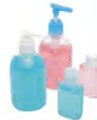
SI15 - Hand Sanitizer Size: 60ml, 100ml, 250ml, etc. Smell: apple, lemon, menthol, etc.