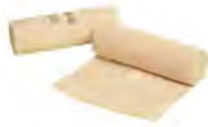
SA04 - Spandex Plain Bandage Size: 5cm x 4.5m, 7.5cm x 4.5m, 10cm x 4.5m, 15cm x 4.5m. Weight: 80g/m 2 . Color: natural white. Material: cotton + spandex.