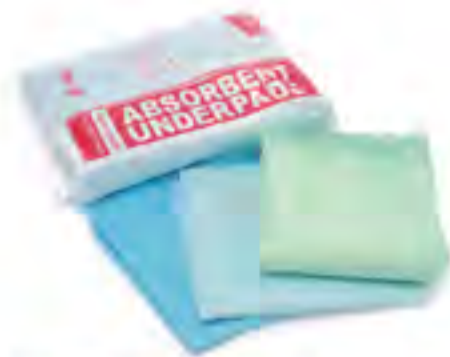
SK01 - Absorbent Underpad Size: 40 x 60cm, 60 x 60cm, 60 x 90cm, 76 x 76cm, 76 x 90cm, 80 x 180cm, etc. Color: blue, green, white, etc. Material: PE + PP + paper + wood pulp + SAP. Weight: 20 - 110 g/pc.