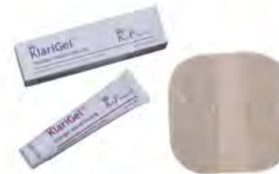
SF11 - Hydrogel Dressing Size: 5x5cm, 10x10cm, 10x20cm, 15x15cm, 15g, 42g, 85g, etc. Material: hygroscopic macromolecules gelatin.