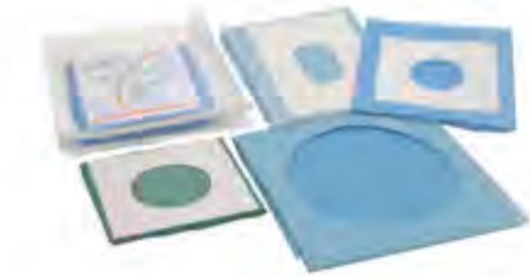
SK12 - Surgical Drape with hole Size: 50 x 50cm, 50 x 60cm, 60 x 60cm, 75 x 75cm, 90 x 90cm, etc. Color: blue, green, white, etc. Material: SMS, PP + PE, impregnated cloth + PE, etc. Type: adhesive or non-adhesive.