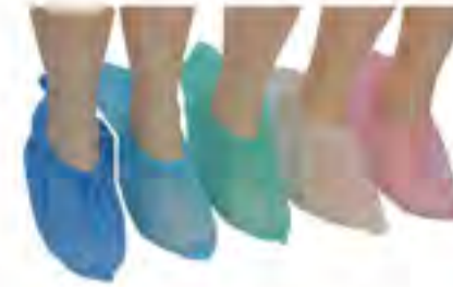
SJ25 - Non-woven Shoe Cover Size: 17 x 41cm, 18 x 42cm, 18 x 45cm, etc. Color: green, blue, white, pink, etc. Material: PP non-woven. Weight: 25g/m 2 , 30g/m 2 , 35g/m 2 , etc. Type: normal, anti-skid.