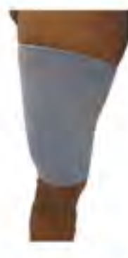
SM0105 - Thigh Support (polyester) Size: S, M, L, XL. Material: polyester + latex.