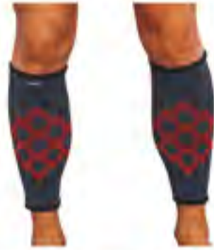
SM0307 - Shin Support (pattern nylon) Size: S, M, L, XL. Material: nylon + latex + spandex.