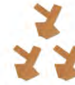
SE27 - Nasal Cannula Fixation Plaster Size: 36x40mm, 59x62mm, 70x71mm. Color: skin. Material: non-woven + glue.