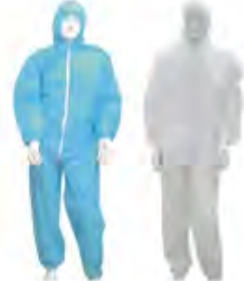
SJ20 - Coverall Size: 140 x 170cm(M), 145 x 175cm(L), 147 x 180cm(XL), 150 x 185cm(XXL), etc. Color: white, blue, etc. Material: PP non-woven, SMS, Microporous. Weight: 30g/m 2 , 35g/m 2 , 40g/m 2 , 45g/m 2 , etc.