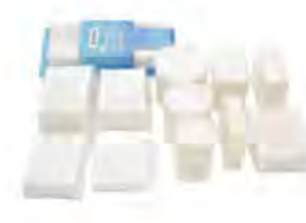
SH10 - Plastic Cotton Swabs Material: plastic stick + cotton tip. Size: 100pcs, 160pcs, 200pcs, 300pcs, 400pcs, 450pcs, etc. Packaging: PE bag, round box, square box, blister card, etc.