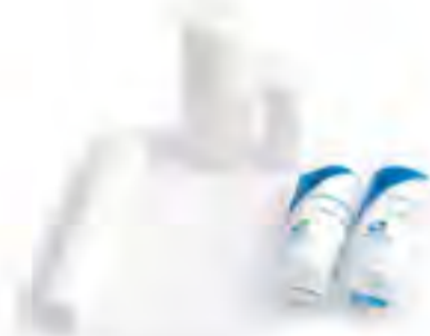
SA05 - Conforming Bandage (Thin PBT) Size: 5cm x 4m, 7.5cm x 4m, 10cm x 4m, 15cm x 4m. Weight: 30g/m 2 . Color: bleached white. Material: 100% polyester.