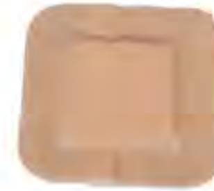
SF08 - Self-adhesive Foam Dressing Size: 10x10cm, 15x15cm, 20x20cm, etc. Material: polyurethane + CMC + PU film.