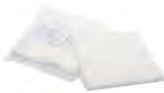
SG11 - Non-sterile Gauze Cutting Size: 10x10cm, 10x20cm, 20x20cm, 30x30cm, 40x40cm, etc. Mesh: 13threads/19x15mesh, 17threads/26x18mesh, 20threads/30x20mesh, etc. Color: bleached white. Material: 100% cotton (40's, 32's, 21's, etc).