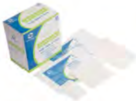
SE14 - Non-woven Wound Dressing Size: 5x7cm, 6x8cm, 10x10cm, 10x12cm, 10x15cm, 10x20cm, 10x25cm, 10x30cm, 10x35cm, etc. Color: white. Material: non-woven + glue.