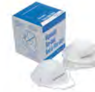
SJ10 - Dust Mask Size: standard. Ply: 1ply. Color: white. Material: PP non-woven. Weight: 120gm 2 , 140gm 2 , 160gm 2 , 180gm 2 , etc.