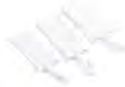
SA11 - Elastic Net Hat Size: S (5.5# / 3.5cm), M (5.8# / 4.2cm), L (6# / 5.8cm). Color: bleached white. Type: i) polyester + rubber; ii) polyester + spandex.