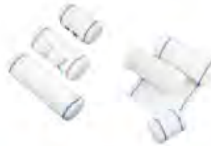
SA03 - Cotton Crepe Bandage Size: 5cm x 4m, 7.5cm x 4m, 10cm x 4m, 15cm x 4m. Weight: 75g/m 2 , 80g/m 2 . Color: natural white, bleached white. Material: 100% cotton.