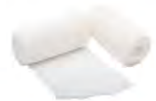
SG03 - Crinkle Gauze Roll Size: 4.5' x 4.1yds, etc. Mesh: 8threads/12x8mesh, 12threads/19x11mesh, etc. Color: bleached white. Material: 100% cotton (40's, 32's, 21's, etc).