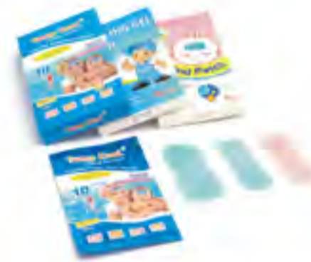
SF20 - Cooling Gel Patch Size: 4x10cm, 5x12cm, etc. Color: blue, red, green, yellow, etc. Smell: apple, orange, menthol, candy, etc. Material: non-woven + hydrogel, menthol, borneol, etc.