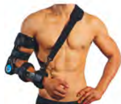
SM0811 - Elbow Holder Size: one size fits all. Material: nylon + foam + PE plate + aluminium alloy holder.