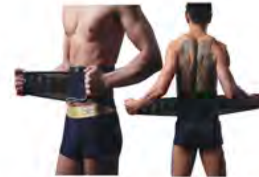
SM0507 - Waist Support with Metal Sping (neoprene) Size: one size fits all. Material: neoprene + nylon + spandex + metal sping.