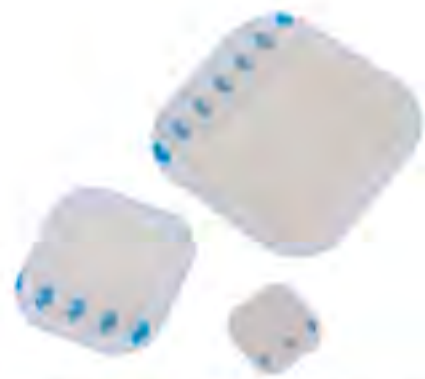
SF01 - Hydrocolloid Dressing (with thin border) Size: 5x5cm, 10x10cm, 15x15cm, 15x20cm, 20x20cm, 8x12cm, 15x18cm, etc. Material: pressure sensitive adhesive + CMC.