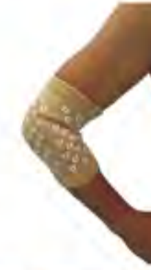
SM0702 - Elbow Support (far infrared ray) Size: S, M, L, XL. Material: polyester + latex + far infrared ray.