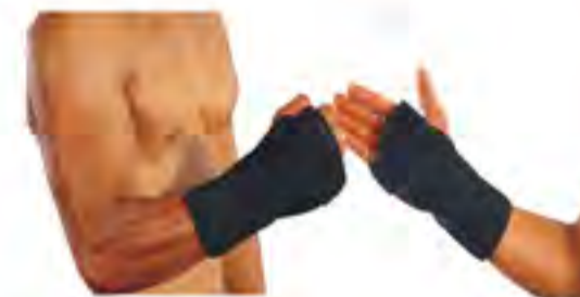
SM0803 - Wrist Support with Aluminium Alloy Holder Size: one size fits all. Material: mesh fabric + foam + velvet + aluminium alloy holder.