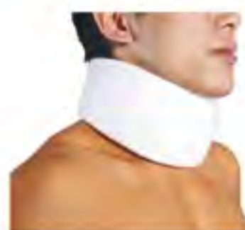
SM0814 - Cervical Collar Size: S, M, L, XL. Material: polyester yarn + high density foam + POM buckle.