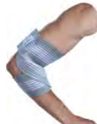
SM0602 - Elbow Wrap Size: one size fits all. Material: polyester + latex.