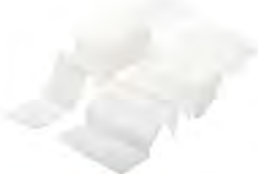
SG14 - Sterile Gauze Zig-zag Size: 1/2yd x 2 1/2yds, 1/2yd x 5yds, etc. Mesh: 13threads/19x15mesh, 17threads/26x18mesh, 20threads/30x20mesh, etc. Color: bleached white. Material: 100% cotton (40's, 32's, 21's, etc). Individual packaging: 1pc/pouch, etc.