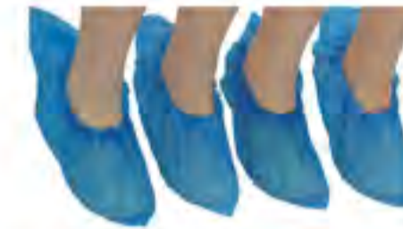
SJ28 - CPE Shoe Cover Size: 15 x 38cm, 15 x 41cm, etc. Color: green, blue, white, etc. Material: CPE. Weight: 2g/pc, 2.5g/pc, 3g/pc, 3.5g/pc, 4g/pc, etc.