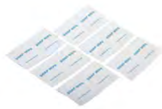
SI08 - Soap Wipe Size: 120x150mm-24ply, 120x200mm-32ply, etc.