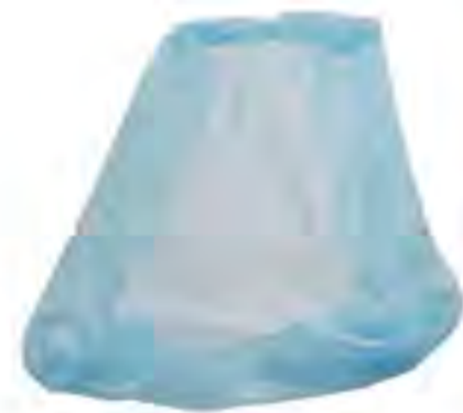
SK04 - Disposable Bedcover Size: 75 x 185cm, 75 x 200cm, 75 x 210cm, 100 x 210cm, 150 x 210cm, 200 x 210cm, etc. Color: white, blue, green, pink, yellow, etc. Material: PP non-woven, SMS, PP+PE. Weight: 20g/m 2 , 25g/m 2 , 30g/m 2 , 35g/m 2 , 40g/m 2 , etc.