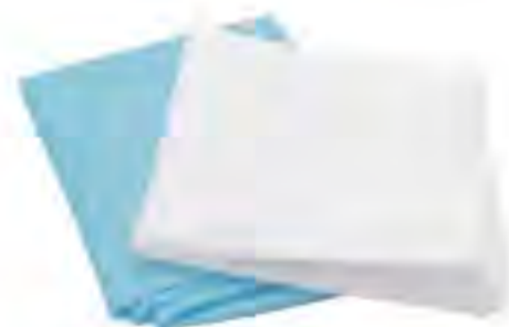
SK05 - Disposable Pillowcover Size: 45 x 75cm, 51 x 81cm, etc. Color: white, blue, green, etc. Material: PP non-woven. Weight: 20g/m 2 , 25g/m 2 , 30g/m 2 , etc.