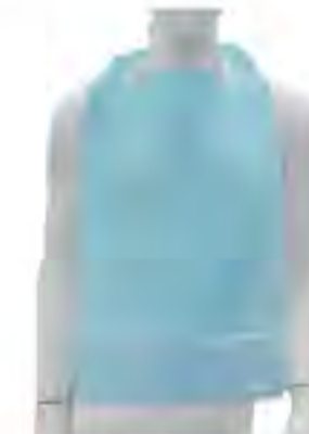
SK10 - Dental Apron Size: 37 x 66cm, 37 x 51cm, 37 x 54cm, 38 x 57cm, 40 x 50cm, etc. Color: blue, green, white, etc. Material: paper + PE film. Weight: 40g/m 2 , etc.