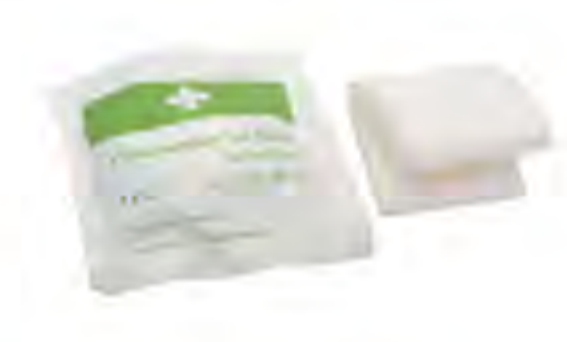
SG24 - Sterile Bum Dressing Size: 40x60cm, 55x75cm, 90x75cm, etc. Weight: 30g/m 2 , 40g/m 2 , etc. Color: white, blue, green, etc. Material: PP non-woven.