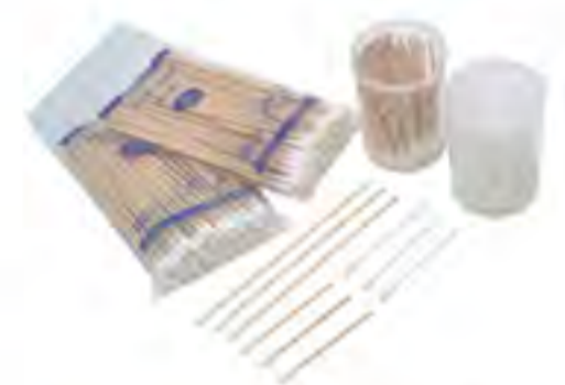
SH15 - Medical Cotton Swabs (Single Tip) Type: wooden stick; plastic stick. Size: 7.5cm(100pcs), 15cm(100pcs). Packaging: PE bag, round box.