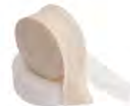
SB06 - Stockinet Bandage Width: A#(5cm), B#(7.5cm), C#(10cm), D#(15cm), E#(20cm), etc. Length: 20m, etc. Color: natural white, bleached white. Type: i) 100% cotton; ii) 100% polyester.