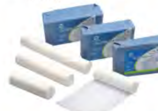
SG04 - Gauze Bandage with cutting edge (W.O.W Bandage) Size: 5cm x 5m, 7.5cm x 5m, 10cm x 5m, 15cm x 5m, etc. Mesh: 12threads/19x11mesh, 13threads/19x15mesh, 17threads/26x18mesh, 20threads/30x20mesh, etc. Color: bleached white. Material: 100% cotton (40's, 32's, 21's, etc).