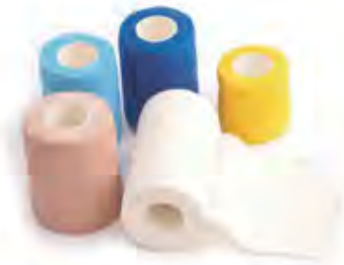
SC02 - Cohesive Elastic Bandage (Cotton Type) Size: 2.5cm x 4.5m, 5cm x 4.5m, 7.5cm x 4.5m, 10cm x 4.5m, 15cm x 4.5m. Color: skin, white, blue, green, pink, red, yellow, orange, black, etc. Material: cotton + elastic yarn + glue.