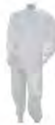
SJ21 - Scrub Suit Size: 110 x 130cm(S), 115 x 137cm(M), 120 x 140cm(L), 125 x 145cm(XL), 130 x 150cm(XXL), etc. Color: blue, green, white, etc. Material: PP non-woven, SMS. Weight: 25g/m 2 , 30g/m 2 , 35g/m 2 , 40g/m 2 , etc.