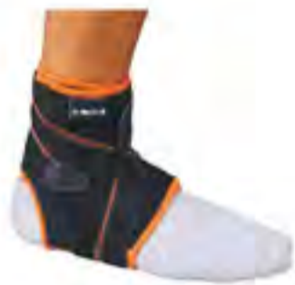
SM0516 - Ankle Support with Metal Spring (neoprene) Size: one size fits all. Material: neoprene + nylon + spandex + metal spring.