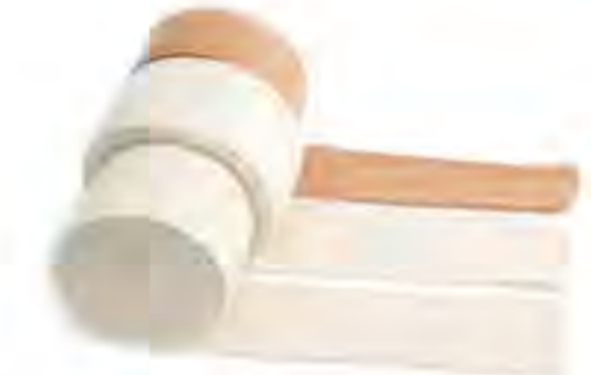
SB05 - Tubular Bandage Width: A#(4.5cm), B#(6.5cm), C#(6.75cm), D#(7.5cm), E#(8.75cm), F#(10cm), G#(12cm), H#(17.5cm), I#(21.5cm), J#(32.5cm), etc. Length: 10m, etc. Color: natural white, skin. Material: cotton + rubber.