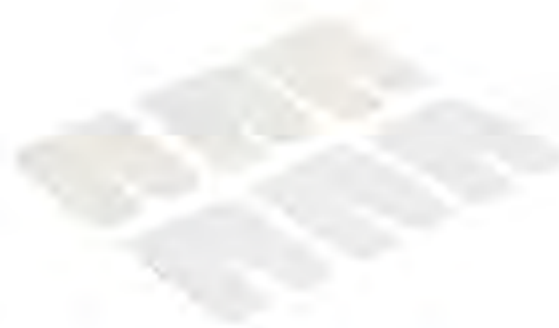
SE18 - Non-woven I.V. Dressing Size: 6x7cm, 6x8cm. Color: white. Material: non-woven + glue.