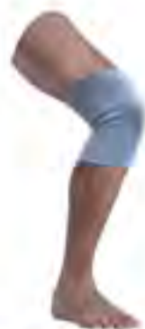
SM0104 - Knee Support (polyester) Size: S, M, L, XL. Material: polyester + latex.