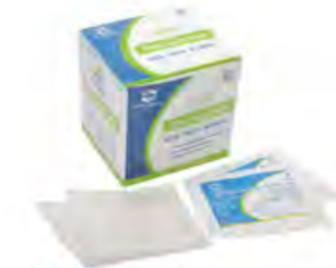
SG08 - Sterile Gauze Swabs Size: 5x5cm, 7.5x7.5cm, 10x10cm, 10x20cm, etc. Ply: 8ply, 12ply, 16ply, 24ply, 32ply. Edge: unfolded edge, folded edge. Mesh: 12threads/19x11mesh, 13threads/19x15mesh, 17threads/26x18mesh, 20threads/30x20mesh, etc. Color: bleached white. Material: 100% cotton (40's, 32's, 21's, etc). Type: i)without x-ray; ii)with x-ray. Individual packaging: 1pc/pouch, 2pcs/pouch, 5pcs/pouch, etc.