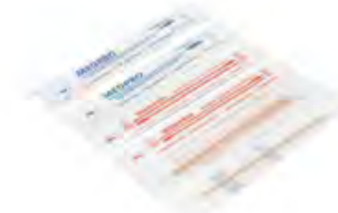
SH16 - Sterile Cotton Swabs (Single Tip) Type: wooden stick; plastic stick. Size: 15cm. Packaging: 1pc/pouch, 2pcs/pouch, etc.