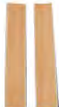
SE12 - PE Dressing Plaster Width: 4cm, 6cm, 8cm, etc. Length: 10cm, 25cm, 50cm, 100cm, 500cm, etc. Color: skin, transparent. Material: PE + glue.