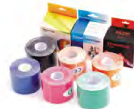
SC08 - Kinesiology Tape Size: 2.5cm x 5m, 3.8cm x 5m, 5cm x 5m, 7.5cm x 5m. Color: skin, white, blue, green, yellow, red, pink, black, etc. Material: cotton + elastic yarn + glue.