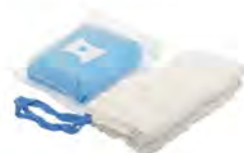
SG16 - Sterile Laparotomy Sponge Size: 30x30cm, 40x40cm, 45x45cm, etc. Ply: 4ply, 6ply, 8ply, 12ply, etc. Mesh: 12threads/19x11mesh, 13threads/19x15mesh, 17threads/26x18mesh, 20threads/30x20mesh, etc. Color: bleached white. Material: 100% cotton (40's, 32's, 21's, etc). Type: prewashed or unwashed, with or without x-ray, with or without loop. Individual packaging: 2pcs/pouch, 5pcs/pouch, etc.