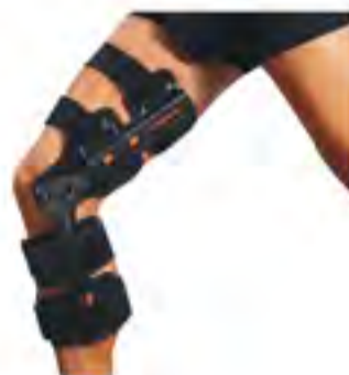
SM0812 - Knee Holder Size: one size fits all. Material: nylon + foam + PE plate + aluminium alloy holder.