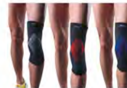
SM0304 - Knee Support (pattern nylon) Size: S, M, L, XL. Material: nylon + latex + spandex.