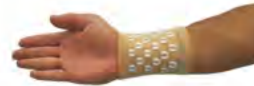
SM0701 - Wrist Support (far infrared ray) Size: S, M, L, XL. Material: polyester + latex + far infrared ray.