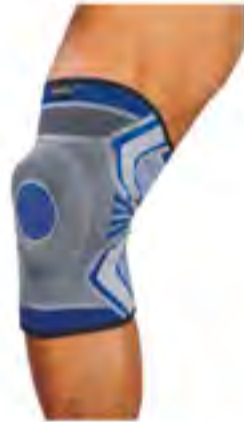
SM0402 - Knee Support with Metal Sping (silica gel) Size: S, M, L, XL. Material: nylon + latex + spandex + silica gel + metal sping.