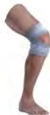
SM0603 - Knee Wrap Size: one size fits all. Material: polyester + latex.