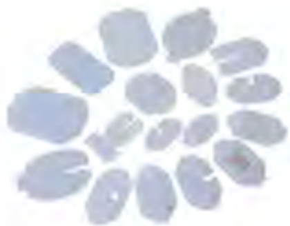
SE17 - Transparent Film Dressing Size: 4.4x4.4cm, 6x7cm, 7x10cm, 10x11.5cm, 10x12cm, 10x15cm, 10x20cm, 10x25cm, 15x20cm, 20x28cm. Color: transparent. Material: PU film + glue.