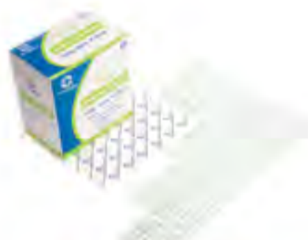
SE15 - PU Wound Dressing Size: 5x7cm, 6x8cm, 10x10cm, 10x12cm, 10x15cm, 10x20cm, 10x25cm, 10x30cm, 10x35cm, etc. Color: transparent. Material: PU film + glue.