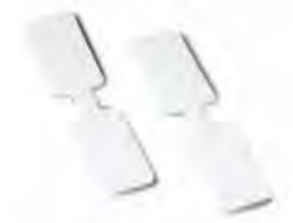
SE25 - Butterfly Closure Size: 45x10mm, 72x12mm. Color: white. Material: cotton fabric composited with PE + glue.