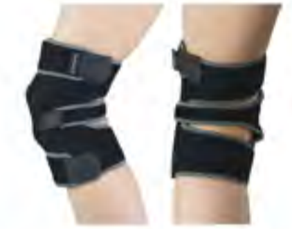
SM0509 - Knee Support with Metal Sping (neoprene) Size: one size fits all. Material: neoprene + nylon + spandex + metal sping.