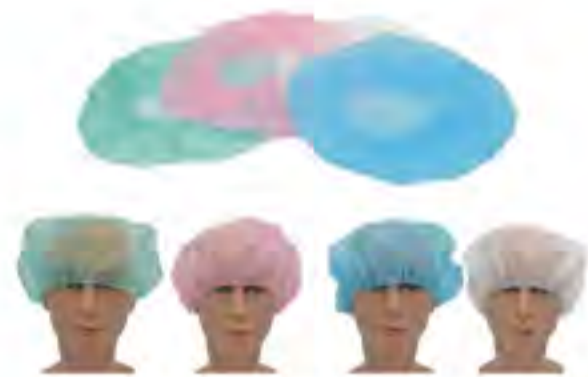
SJ01 - Bouffant Cap (Round Cap) Size: 18", 19", 21", 24", etc. Color: blue, green, white, pink, etc. Material: PP non-woven. Weight: 10 - 20 gm 2 .