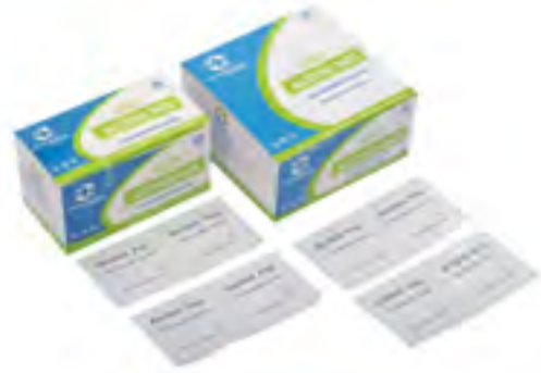
SI01 - Alcohol Pad Size: 30x60mm-2ply, 60x60mm-4ply, etc.