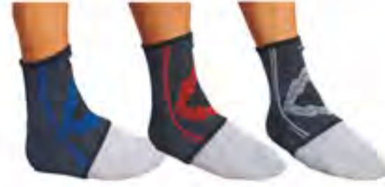
SM0308 - Ankle Support (pattern nylon) Size: S, M, L, XL. Material: nylon + latex + spandex.