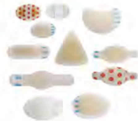
SF05 - Hydrocolloid Blister Plaster Size: 28x46mm, 35x54mm, 44x69mm, 18x52mm, 20x60mm, 28x69mm, 50x50mm, etc. Material: pressure sensitive adhesive + CMC.