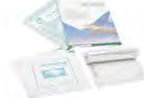
SG22 - Paraffin Gauze Size: 5x5cm, 7.5x7.5cm, 10x10cm, 10x20cm, 20x20cm, etc. Color: white, yellow. Material: gauze + vaseline, etc.