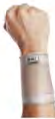
SM0201 - Wrist Support (skin nylon) Size: S, M, L, XL. Material: nylon + latex + spandex.