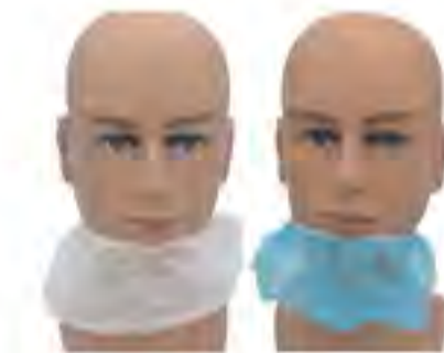
SJ33 - Non-woven Beard Cover Size: 18", 19", 21", etc. Color: blue, green, white, etc. Material: PP non-woven. Weight: 10 - 14 gm 2 .