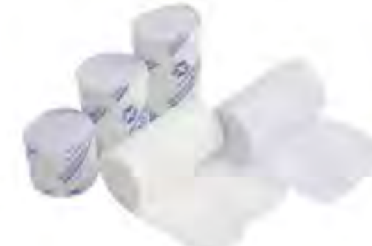
SB04 - Orthopedic Padding Width: 5cm, 7.5cm, 10cm, 15cm, 20cm. Length: 2.7m, 3m, etc. Color: white. Weight: 70 - 90 g/m 2 . Type: i) polyester; ii) cotton; iii) polyester & viscose.