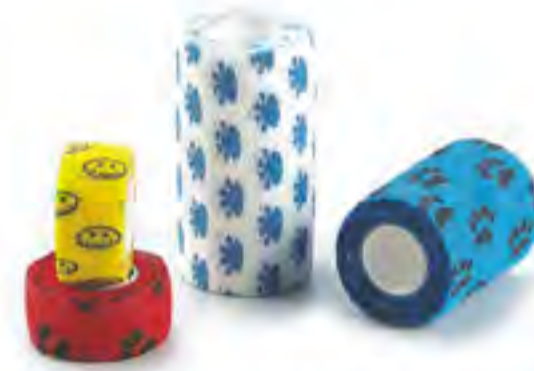
SC05 - Cohesive Elastic Bandage (Pets Type) Size: 2.5cm x 4.5m, 5cm x 4.5m, 7.5cm x 4.5m, 10cm x 4.5m, 15cm x 4.5m. Color: pet pattern. Material: non-woven + elastic yarn + glue.