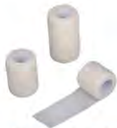
SC03 - Cohesive Elastic Bandage (PBT Type) Size: 4cm x 4m, 6cm x 4m, 8cm x 4m, 10cm x 4m, 12cm x 4m. Color: white, yellow, etc. Material: PBT + glue.