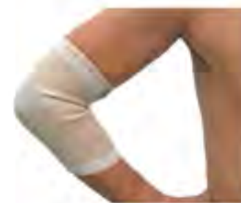
SM0202 - Elbow Support (skin nylon) Size: S, M, L, XL. Material: nylon + latex + spandex.