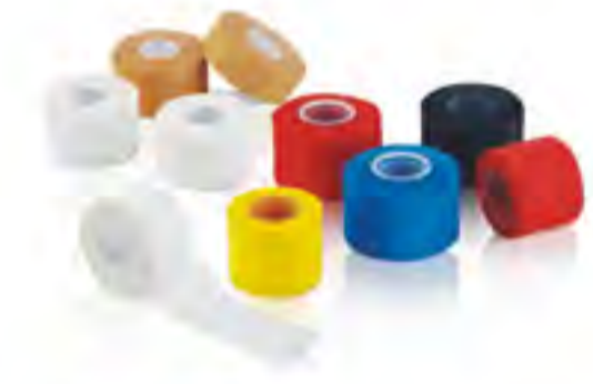
SC12 - Sport Tape Size: 2.5cm x 10yds, 3.8cm x 10yds, 5.0cm x 10yds, 2.5cm x 15yds, 3.8cm x 15yds, 5.0cm x 15yds. Color: white, skin, yellow, blue, green, red, black, etc. Material: cotton + glue.