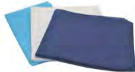
SK02 - Disposable Bedsheet (Non-woven) Size: 80 x 180cm, 80 x 200cm, 80 x 210cm, 100 x 200cm, 120 x 220cm, 140 x 240cm, etc. Color: white, blue, green, etc. Material: PP non-woven. Weight: 25g/m 2 , 30g/m 2 , 35g/m 2 , 40g/m 2 , etc.