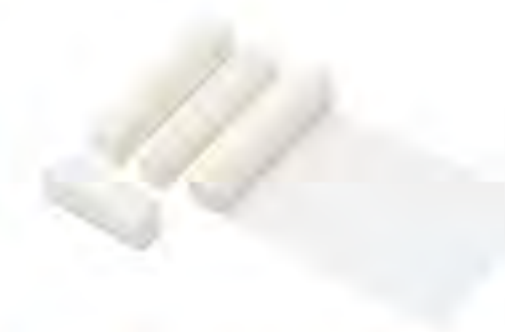
SG05 - Gauze Bandage with woven edge Size: 5cm x 4.5m, 7.5cm x 4.5m, 10cm x 4.5m, 15cm x 4.5m, etc. Mesh: 13threads/19x15mesh, 17threads/24x20mesh, 20threads/30x20mesh, etc. Color: bleached white. Material: 100% cotton (40's, 32's, 21's, etc).