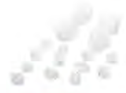
SG21 - Gauze Balls Size: 15x15cm, 20x20cm, 25x25cm, 30x30cm, 30x40cm, 40x50cm, etc. Mesh: 17threads/26x18mesh, 20threads/30x20mesh, etc. Color: bleached white. Material: 100% cotton (40's, 32's, 21's, etc). Type: with or without x-ray.