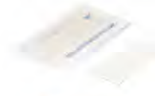
SE24 - Wound Skin Closure Size: 3x75mm, 6x38mm, 6x75mm, 6x100mm, 12x50mm, 12x100mm, 12x125mm, 25x100mm, etc. Color: white, skin. Type: i)non-woven; ii)PU.