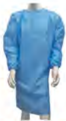
SJ17 - Sterile SMS Surgical Gown Size: 120 x 140cm(L), 125 x 145cm(XL), 130 x 150cm(XXL), etc. Color: blue, green, white, etc. Material: SMS. Weight: 30g/m 2 , 35g/m 2 , 40g/m 2 , 45g/m 2 , etc. Packaging: 1pc/pouch.