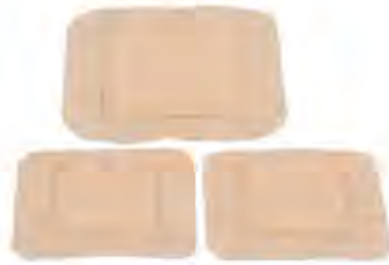
SF16 - Silicone Foam Dressing with border Size: 7.5x7.5cm, 10x10cm, 12.5x12.5cm, 15x15cm, 15x20cm, etc. Material: polyurethane + silicone gel + PU film.