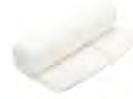
SG20 - Non-woven Abdominal Roll Width: 10cm, 15cm, 20cm, etc. Length: 1m, 1.5m, 2m, etc. Color: white, blue, green. Material: non-woven + wood pulp.