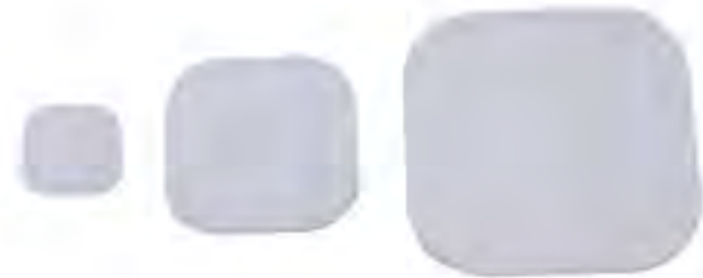
SF04 - Hydrocolloid Dressing (HP extra thin) Size: 5x5cm, 10x10cm, 15x15cm, 15x20cm, 20x20cm, etc. Material: pressure sensitive adhesive + CMC + polyurethane.