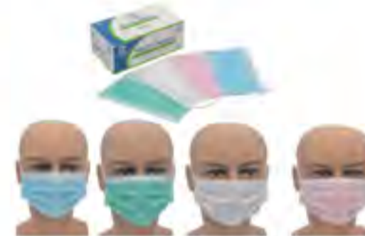
SJ05 - Non-woven Face Mask (Earloops Type) Size: 17.5 x 9.5cm. Ply: 2ply, 3ply. Color: green, blue, white, pink, etc. Material: PP non-woven + meltblown fabric. Weight: 18+20+25 gm 2 , etc.