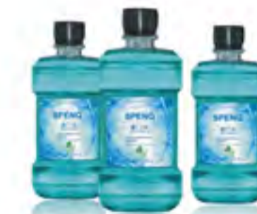
SI16 - Mouthwash Size: 250ml, 500ml, etc. Smell: apple, lemon, menthol, etc.