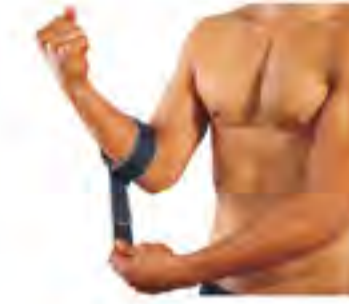
SM0505 - Elbow Support (neoprene) Size: one size fits all. Material: neoprene + nylon + silica gel.