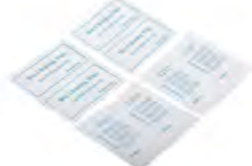
SI05 - Wet Cleaning Wipe Size: 120x150mm-24ply, 120x200mm-32ply, etc.