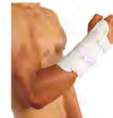
SM0801 - Wrist Support with Aluminium Alloy Holder Size: one size fits all. Material: mesh fabric + foam + velvet + aluminium alloy holder.