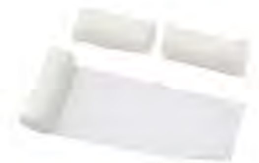
SG06 - Crochet Gauze Bandage Size: 5cm x 5m, 7.5cm x 5m, 10cm x 5m, 15cm x 5m, etc. Weight: 36g/m 2 , 70g/m 2 , etc. Color: bleached white. Type: i)100% cotton; ii)100% polyester.