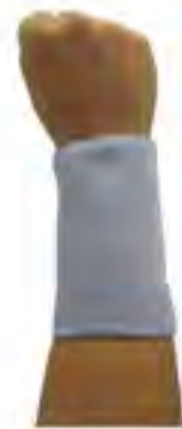
SM0102 - Wrist Support (polyester) Size: S, M, L, XL. Material: polyester + latex.