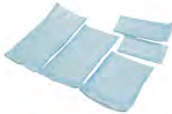
SL02 - Heat-sealing Sterilization Pouch Size: 75 x 200mm, 75 x 250mm, 75 x 280mm, 100 x 125mm, 100 x 150mm, 100 x 200mm, 140 x 160mm, 150 x 200mm, 150 x 300mm, 200 x 300mm, 200 x 400mm, etc. Color: blue, green. Material: medical grade paper + PET/PP film.