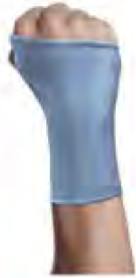
SM0101 - Wrist Support (polyester) Size: S, M, L, XL. Material: polyester + latex.