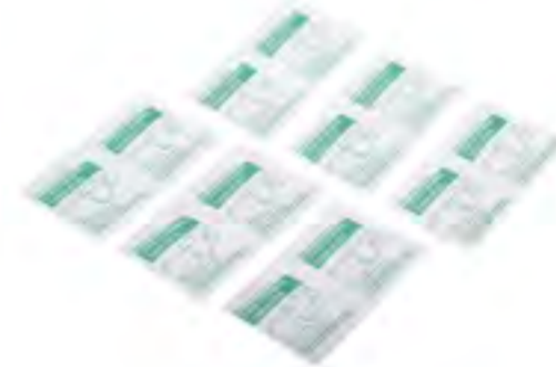
SI06 - Lens Cleaning Towelette Size: 120x150mm-24ply, 120x200mm-32ply, etc.