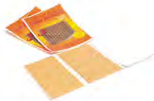
SF19 - Capsicum Plaster Size: 4x6.4cm, 10x18cm, 12x18cm, etc. Color: white, skin. Material: cotton fabric + capsicum, menthol, crystal, ginger, borneol, etc.