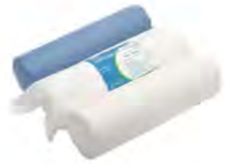
SH01 - Absorbent Cotton Wool Size: 50g, 100g, 200g, 250g, 400g, 454g, 500g, 1000g, etc. Color: bleached white. Material: 100% cotton.