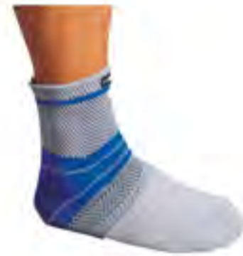
SM0404 - Ankle Support (silica gel) Size: S, M, L, XL. Material: nylon + latex + spandex + silica gel.