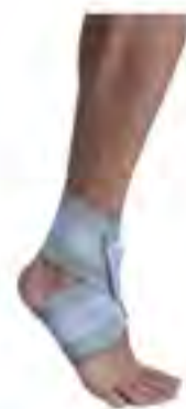
SM0604 - Ankle Wrap Size: one size fits all. Material: polyester + latex.