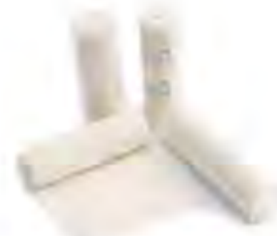
SA07 - Crepe PBT Bandage Size: 5cm x 4m, 7.5cm x 4m, 10cm x 4m, 15cm x 4m. Weight: 70g/m 2 , 75g/m 2 , 80g/m 2 . Color: natural white. Material: cotton + spandex + polyester.