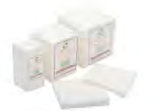
SG09 - Non-sterile Non-woven Swabs Size: 5x5cm, 7.5x7.5cm, 10x10cm, 10x20cm, etc. Ply: 4ply, 6ply, 8ply. Weight: 30g/m 2 , 40g/m 2 , etc. Color: bleached white. Material: polyester + viscose. Type: i)without x-ray; ii)with x-ray.