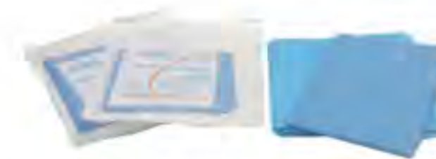
SK11 - Surgical Drape Size: 40 x 40cm, 50 x 50cm, 60 x 60cm, 75 x 75cm, 75 x 90cm, 100 x 100cm, etc. Color: blue, green, white, etc. Material: SMS, PP + PE, impregnated cloth + PE, etc.