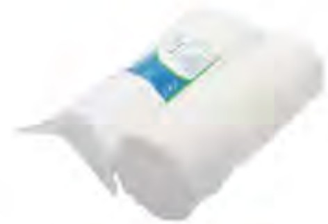
SH04 - Coreless Cotton Wool Size: 400g, 454g, 500g, etc. Color: bleached white. Material: 100% cotton.