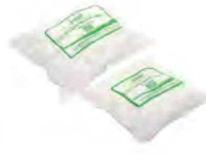
SH06 - Non-sterile Cotton Balls Size: 0.3g/pc, 0.5g/pc, 1g/pc, 2g/pc, 3g/pc, 4g/pc, etc. Color: bleached white. Material: 100% cotton. Packaging: 25g/bag, 50g/bag, 100g/bag, 150g/bag, 200g/bag, 250g/bag, 500g/bag, etc.