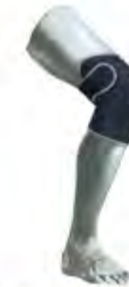
SM0508 - Knee Support (neoprene) Size: one size fits all. Material: neoprene + nylon + spandex.