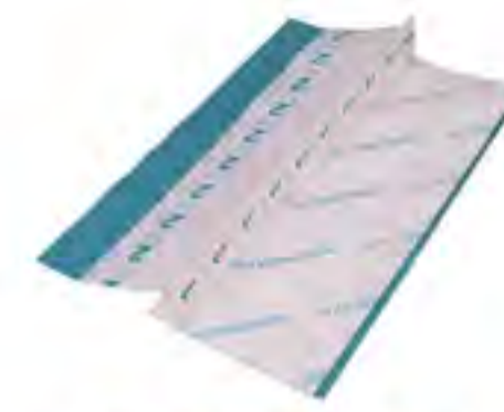
SE21 - PU Surgical Incise Film Size: 15x28cm, 20x30cm, 30x28cm, 30x40cm, 40x42cm, 45x28cm, 45x55cm, 55x55cm, 56x84cm, etc. Color: transparent. Material: PU film + glue.