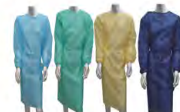
SJ13 - PP Isolation Gown Size: 110 x 130cm(S), 115 x 137cm(M), 120 x 140cm(L), 125 x 145cm(XL), 130 x 150cm(XXL), etc. Color: blue, green, yellow, white, etc. Material: PP non-woven. Weight: 20gm 2 , 25gm 2 , 30gm 2 , 35gm 2 , 40gm 2 , etc.