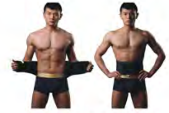
SM0506 - Waist Support (neoprene) Size: one size fits all. Material: neoprene + nylon.