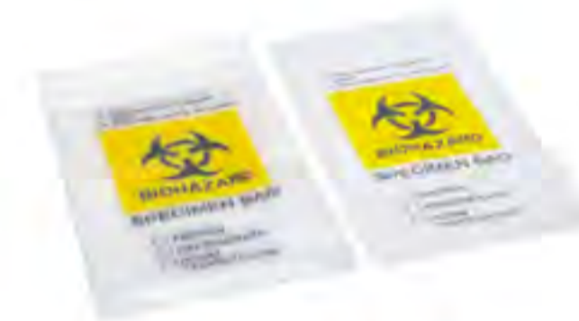
SL09 - Biohazard Bag (Specimen Bag) Size: 15 x 25cm, 20 x 25cm, 30 x 30cm, 35 x 40cm, etc. Color: transparent, yellow, pink, etc. Material: PE. Thickness: 0.045 - 0.2 mm.