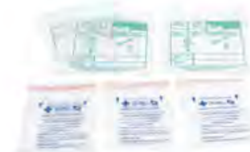
SL10 - Drug Bag Size: 7 x 11cm, 10 x 12cm, etc. Color: transparent, etc. Material: PE. Thickness: 0.025 - 0.05 mm.