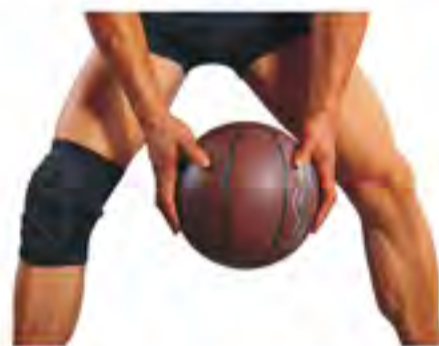
SM0810 - Reinforced Knee Support Size: S, M, L, XL. Material: nylon + polyester + spandex + latex + EVA gel.