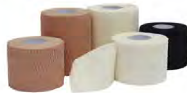
SC07 - Tear Elastic Adhesive Bandage Size: 5cm x 4.5m, 7.5cm x 4.5m, etc. Color: white, skin, etc. Material: cotton + elastic yarn + glue.