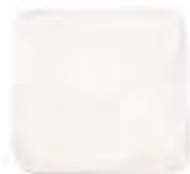
SF06 - Foam Dressing Size: 5x5cm, 10x10cm, 15x15cm, 15x20cm, 20x20cm, etc. Material: polyurethane + CMC.