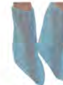
SJ29 - Non-woven Boot Cover Size: 38 x 40cm, 40 x 50cm, etc. Color: blue, green, white, etc. Material: PP non-woven. Weight: 25g/m 2 , 30g/m 2 , 35g/m 2 , 40g/m 2 , etc.