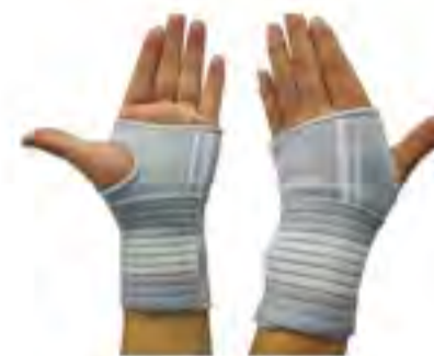
SM0605 - Hand Wrap Size: one size fits all. Material: polyester + nylon + latex.