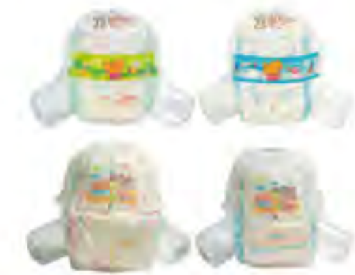
SK08 - Baby Diaper Size: 390 x 270mm(S), 450 x 320mm(M), 490 x 320mm(L), 525 x 340mm(XL), etc. Color: cartoon pattern. Material: PE film or clothlike film + imported SAP + fluff pulp, etc. Weight: 19 - 42 g/pc. Type: i) PE film backsheet + PP tape; ii) clothlike film backsheet + magic tape; iii) clothlike film backsheet + elastic tape.