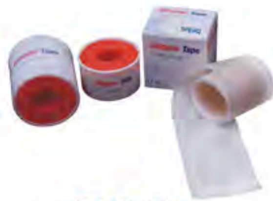
SF17 - Silicone Tape Size: 2.5cm x 1.5cm, 3.5cm x 1.5cm, 4cm x 1.5cm, 7.5cm x 1.5cm, 2.5cm x 5m, 5cm x 5m, etc. Material: PU film + silicone gel.