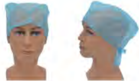
SJ03 - Doctor Cap (Surgeon Cap) - Tie Type Size: 64x13cm, etc. Color: blue, green, etc. Material: PP non-woven. Weight: 20 - 30 gm 2 .