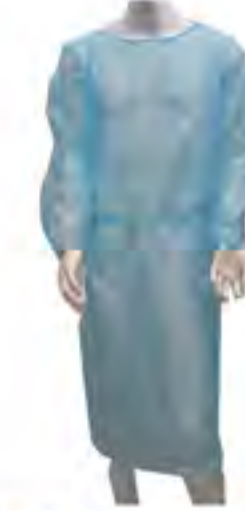
SJ16 - PP+PE Isolation Gown Size: 110 x 130cm(S), 115 x 137cm(M), 120 x 140cm(L), 125 x 145cm(XL), 130 x 150cm(XXL), etc. Color: blue, green, yellow, white, etc. Material: PP non-woven + PE. Weight: 20gm 2 , 25gm 2 , 30gm 2 , 35gm 2 , 40gm 2 , etc.