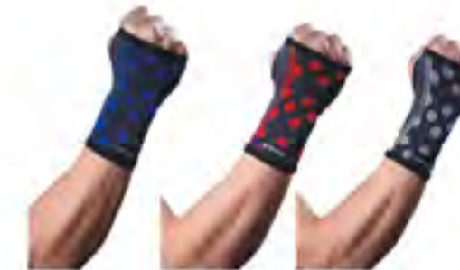
SM0301 - Wrist Support (pattern nylon) Size: S, M, L, XL. Material: nylon + latex + spandex.