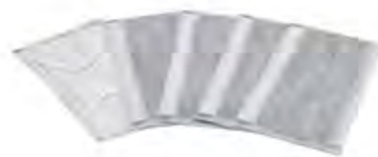
SJ07 - Active Carbon Face Mask Size: 17.5 x 9.5cm. Ply: 4ply. Color: black. Material: PP non-woven + meltblown fabric + active carbon layer. Weight: 18+40+20+25 gm 2 , etc.