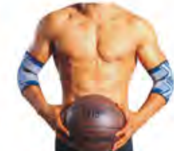
SM0303 - Elbow Support (pattern nylon) Size: S, M, L, XL. Material: nylon + latex + spandex.