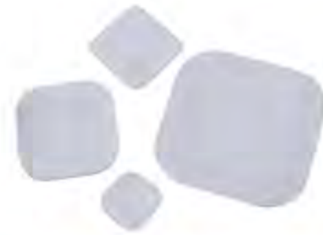
SF03 - Hydrocolloid Dressing (HP with border) Size: 5x5cm, 10x10cm, 15x15cm, 15x20cm, 20x20cm, etc. Material: pressure sensitive adhesive + CMC + polyurethane.