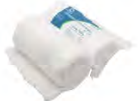
SH02 - Manual Cotton Wool Size: 50g, 100g, 150g, etc. Color: bleached white. Material: 100% cotton.