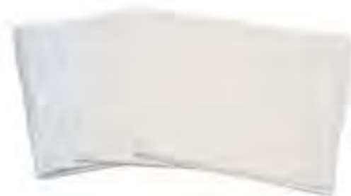
SK03 - Disposable Bedsheet (Paper+PE) Size: 80 x 180cm, 80 x 200cm, 80 x 210cm, 100 x 200cm, 120 x 220cm, 140 x 240cm, etc. Color: white, blue, green, etc. Material: Paper + PE. Weight: 38g/m 2 , 40g/m 2 , 42g/m 2 , etc.