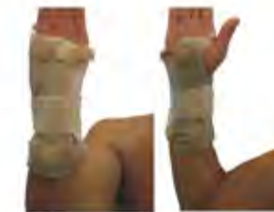
SM0804 - Wrist Support with Aluminium Alloy Holder Size: one size fits all. Material: polyester + leather + aluminium alloy holder.