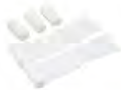
SA08 - PBT First Aid Bandage Size: 4cm x 2.5m (pad 4cm x 6cm), 6cm x 2.5m (pad 6cm x 8cm), 8cm x 2.5m (pad 8cm x 10cm), 10cm x 2.5m (pad 10cm x 12cm). Color: bleached white. Material: conforming bandage + non-adherent pad.