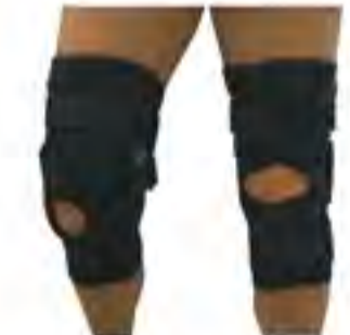
SM0512 - Knee Support with Aluminium Alloy Holder (neoprene) Size: one size fits all. Material: neoprene + nylon + aluminium alloy holder.