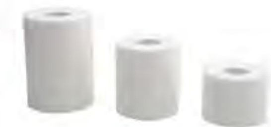
SC14 - PE Foam Tape Size: 2.5cm x 5m, 5cm x 5m, 7.5cm x 5m, 10cm x 5m. Color: white. Material: PE foam + glue.