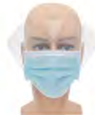
SJ08 - Non-woven Face Mask with Eye Shield Size: 17.5 x 9.5cm. Ply: 3ply. Color: green, blue, white, pink, etc. Material: PP non-woven + meltblown fabric + eye shield. Weight: 18+20+25 gm 2 , etc.