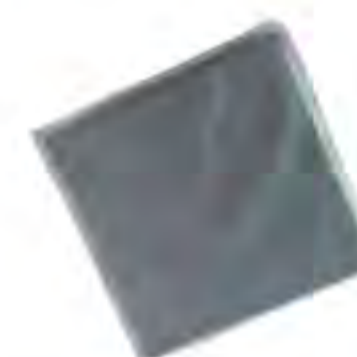
SF13 - Carbon Dressing with Silver Size: 5x5cm, 10x10cm, 10x20cm, 15x15cm, 20x20cm, etc. Material: activated carbon + silver ion.