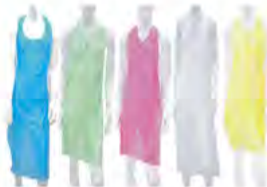
SJ23 - PE Apron Size: 105 x 65cm(S), 117 x 71cm(M), 125 x 80cm(L), etc. Color: blue, green, yellow, white, pink, etc. Material: PE. Weight: 8g/pc, 9g/pc, 10g/pc, etc.