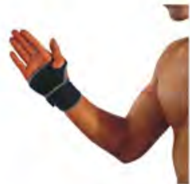
SM0501 - Wrist Support (neoprene) Size: one size fits all. Material: neoprene + nylon.