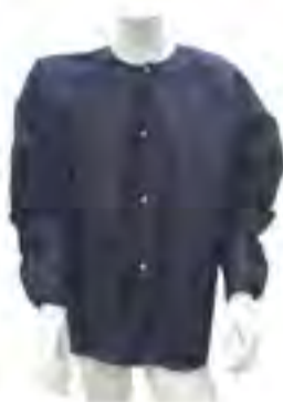
SJ22 - Disposable Jacket Size: 100 x 135cm(S), 105 x 137cm(M), 110 x 140cm(L), 115 x 145cm(XL), 120 x 150cm(XXL), etc. Color: blue, green, white, etc. Material: PP non-woven, SMS. Weight: 25g/m 2 , 30g/m 2 , 35g/m 2 , 40g/m 2 , etc.