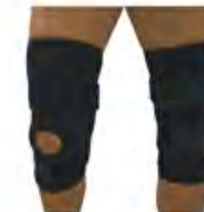
SM0511 - Knee Support with Metal Sping (neoprene) Size: one size fits all. Material: neoprene + nylon + spandex + metal sping.