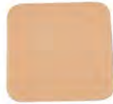
SF07 - PU Foam Dressing Size: 5x5cm, 10x10cm, 15x15cm, 15x20cm, 20x20cm, etc. Material: polyurethane + CMC + PU film.