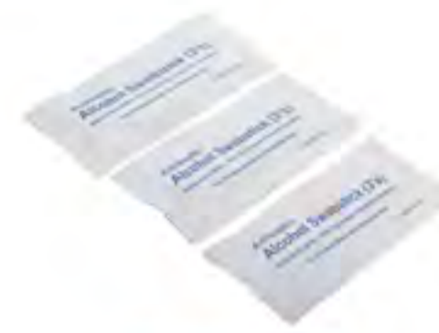
SI09 - Alcohol Swabstick Size: ø10mm x 4". Packaging: 1pc/pouch, 2pcs/pouch, 3pcs/pouch.