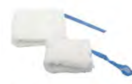
SG15 - Non-sterile Laparotomy Sponge Size: 30x30cm, 40x40cm, 45x45cm, etc. Ply: 4ply, 6ply, 8ply, 12ply, etc. Mesh: 12threads/19x11mesh, 13threads/19x15mesh, 17threads/26x18mesh, 20threads/30x20mesh, etc. Color: bleached white. Material: 100% cotton (40's, 32's, 21's, etc). Type: prewashed or unwashed, with or without x-ray, with or without loop.