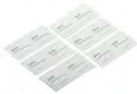
SI04 - BZK Antiseptic Pad Size: 30x60mm-2ply, etc.