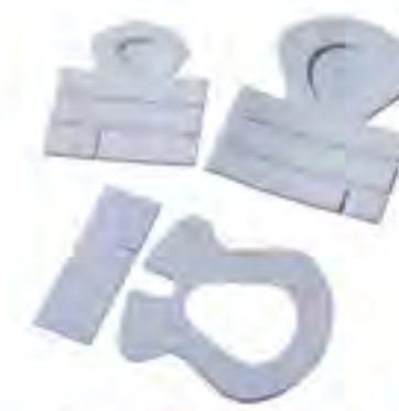
SE20 - PE Foam I.V. Dressing Size: 7.4x9.6cm, 6.3x7.3cm, 7.5x11cm, etc. Color: white. Material: PE Foam + glue.