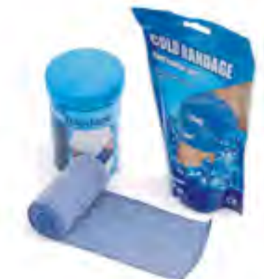
SB08 - Cold Bandage Size: 7.5cm x 3.2m, 10cm x 3.2m. Color: blue. Material: polyester + cotton.