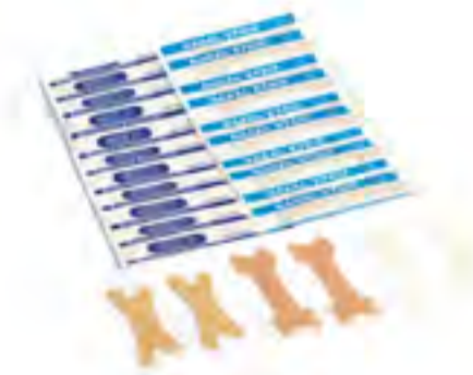
SE26 - Nasal Strip Size: 55x18mm, 66x19mm, etc. Color: skin, transparent. Type: i)non-woven; ii)PE.