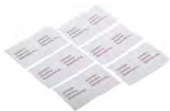
SI07 - Antiseptic Cleaning Wipe (Sting Free) Size: 120x150mm-24ply, 120x200mm-32ply, etc.