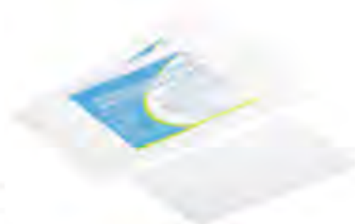
SG12 - Sterile Gauze Cutting Size: 10x10cm, 10x20cm, 20x20cm, 30x30cm, 40x40cm, etc. Mesh: 13threads/19x15mesh, 17threads/26x18mesh, 20threads/30x20mesh, etc. Color: bleached white. Material: 100% cotton (40's, 32's, 21's, etc). Individual packaging: 5pcs/pouch, 10pcs/pouch, etc.