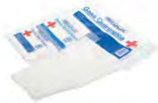
SG13 - Sterile Gauze Piece Size: 1/4yd x 1yd, 1/2yd x 1yd, 1yd x 1yd, etc. Mesh: 13threads/19x15mesh, 17threads/26x18mesh, 20threads/30x20mesh, etc. Color: bleached white. Material: 100% cotton (40's, 32's, 21's, etc). Individual packaging: 1pc/pouch, etc.