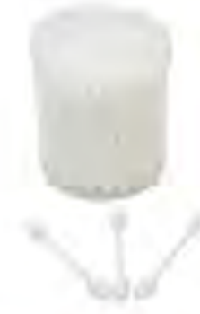
SH13 - Baby Cotton Swabs Type: plastic stick; paper stick. Size: 55pcs. Packaging: round box.