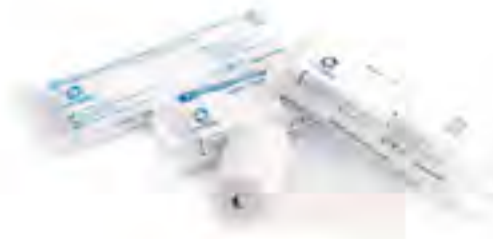
SB01 - Plaster of Paris Bandage Width: 5cm, 7.5cm, 10cm, 15cm, 20cm. Length: 2.7m, 3m, 3.6m, 4.6m, etc. Color: white. Weight: 360 - 420 g/m 2 . Material: gauze + gesso.