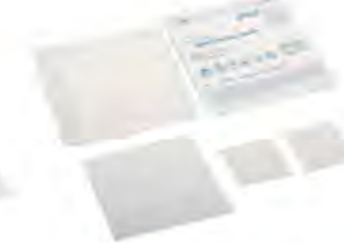
SG23 - Sterile Non-adherent Pad Size: 5x5cm, 7.5x7.5cm, 10x10cm, 10x20cm, 20x20cm, etc. Weight: 180g/m 2 , 200g/m 2 , 220g/m 2 , etc. Color: bleached white. Material: polyester + viscose.