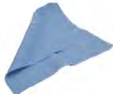
SL06 - SMMS Wrapping Sheet Size: 30 x 30cm, 40 x 40cm, 45 x 45cm, 50 x 50cm, 60 x 60cm, 75 x 75cm, 90 x 90cm, 100 x 100cm, 120 x 120cm, etc. Color: blue, green, white, etc. Material: SMMS.