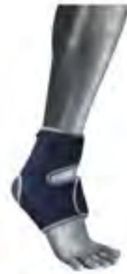
SM0514 - Ankle Support (neoprene) Size: one size fits all. Material: neoprene + nylon.