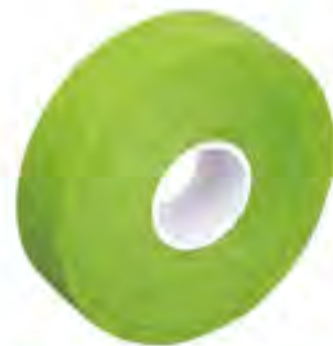
SC04 - Cohesive Elastic Bandage (Gauze Type) Size: 1.25cm x 30yds, 2.0cm x 30yds. Color: white, green, etc. Material: gauze + glue.