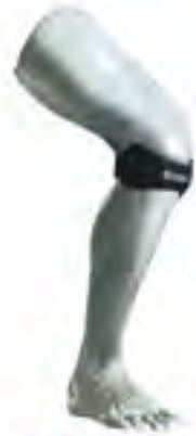
SM0513 - Patella Tendon Strap (neoprene) Size: one size fits all. Material: neoprene + nylon.