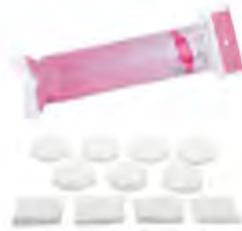
SH09 - Cotton Pads Size: ø57mm, 50x60mm, etc. Color: bleached white. Material: 100% cotton. Packaging: 80pcs/bag, etc.