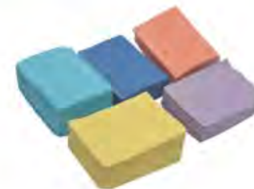
SK09 - Dental Bib Size: 33 x 45cm, 45 x 48cm. Color: blue, yellow, green, pink, orange, purple, white, etc. Material: paper + PE film. Weight: 48g/m 2 , etc.