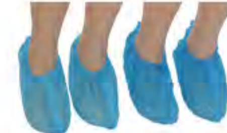
SJ26 - Non-woven Shoe Cover (full rubber band) Size: 17 x 41cm, 18 x 42cm, 18 x 45cm, etc. Color: green, blue, white, pink, etc. Material: PP non-woven. Weight: 25g/m 2 , 30g/m 2 , 35g/m 2 , etc. Type: normal, anti-skid.