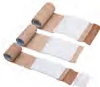
SA09 - Cohesive First Aid Bandage Size: 5cm x 2.5m (pad 5cm x 10cm), 7.5cm x 2.5m (pad 7.5cm x 10cm), 10cm x 2.5m (pad 10cm x 10cm), 15cm x 2.5m (pad 15cm x 15cm). Color: skin, blue, green, white, yellow, pink, red, black, etc. Material: cohesive bandage + non-adherent pad.