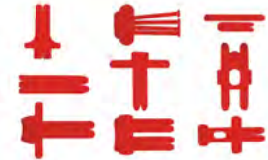
SC09 - Precut Kinesiology Tape Size(Suitable for different parts): elbow, shoulder, knee, wrist, back of hand, neck, waist, foot, leg. Color: skin, white, blue, green, yellow, red, pink, black, etc. Material: cotton + elastic yarn + glue.