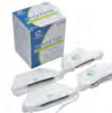
SJ12 - N95 Face Mask (Duckbill Type) Size: standard. Ply: 3ply, 4ply. Color: white. Material: PP non-woven + meltblown fabric + polyester. Type: with or without valve, with or without active carbon.