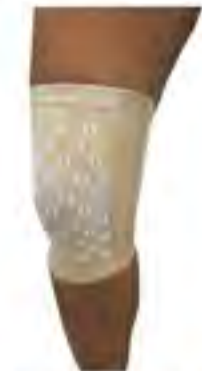
SM0703 - Knee Support (far infrared ray) Size: S, M, L, XL. Material: polyester + latex + far infrared ray.