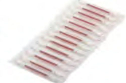
SI14 - Filling Povidone-iodine Swabstick Size: ø5mm x 3". Packaging: 100pcs/bundle.