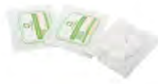
SH07 - Sterile Cotton Balls Size: 0.3g/pc, 0.5g/pc, 1g/pc, 2g/pc, 3g/pc, 4g/pc, etc. Color: bleached white. Material: 100% cotton. Packaging: 5pcs/bag, 10pcs/bag, etc.