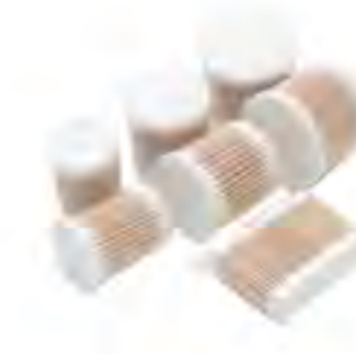
SH11 - Wooden Cotton Swabs Material: wooden stick + cotton tip. Size: 100pcs, 200pcs, 300pcs, etc. Packaging: PE bag, round box, etc.