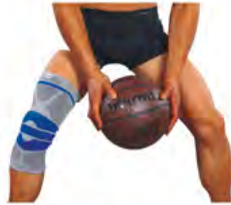
SM0403 - Knee Support with Metal Sping (silica gel) Size: S, M, L, XL. Material: nylon + latex + spandex + silica gel + metal sping.