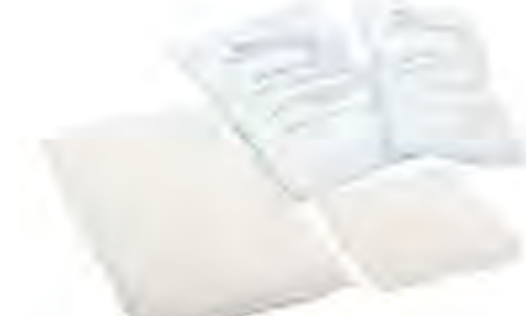
SG17 - Gauze Abdominal Pad Size: 10x10cm, 10x20cm, 13x23cm, 20x25cm, 40x40cm, etc. Color: bleached white. Material: 100% cotton. Type: non-sterile or sterile.