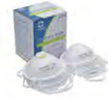
SJ11 - N95 Face Mask (Round Cup Type) Size: standard. Ply: 3ply, 4ply. Color: white. Material: PP non-woven + meltblown fabric + polyester. Type: with or without valve, with or without active carbon.