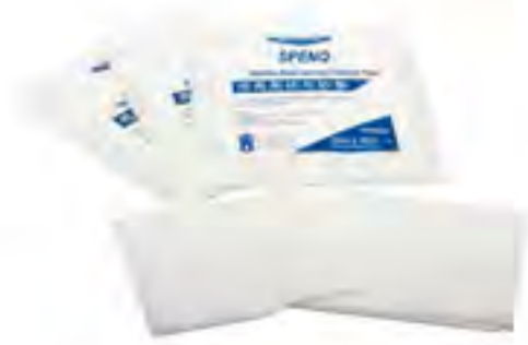
SG10 - Sterile Non-woven Swabs Size: 5x5cm, 7.5x7.5cm, 10x10cm, 10x20cm, etc. Ply: 4ply, 6ply, 8ply. Weight: 30g/m 2 , 40g/m 2 , etc. Color: bleached white. Material: polyester + viscose. Type: i) without x-ray; ii) with x-ray. Individual packaging: 1pc/pouch, 2pcs/pouch, 5pcs/pouch, etc.