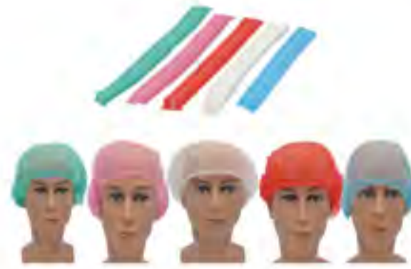
SJ02 - Mob Cap (Clip Cap, Strip Cap) Size: 18", 19", 21", 24", etc. Color: blue, green, white, pink, red, etc. Material: PP non-woven. Weight: 10 - 20 gm 2 .