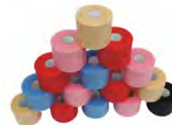
SC13 - PU Foam Underwrap Size: 5cm x 30yds, 7cm x 30yds. Color: skin, red, blue, black, pink, etc. Material: PU foam.