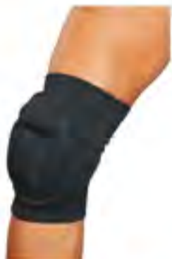
SM0809 - Reinforced Knee Support Size: S, M, L, XL. Material: nylon + polyester + spandex + latex + PU gel.