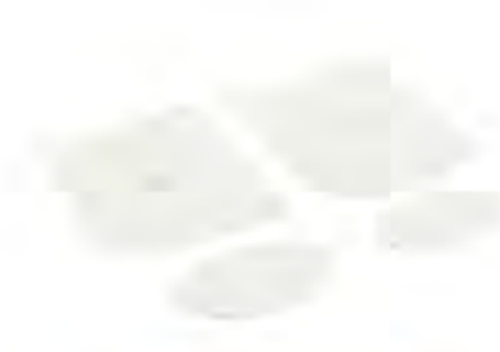
SE23 - Non-adhesive Eye Pad Size: 75x50mm, 80x60mm, etc. Color: white. Material: non-woven.