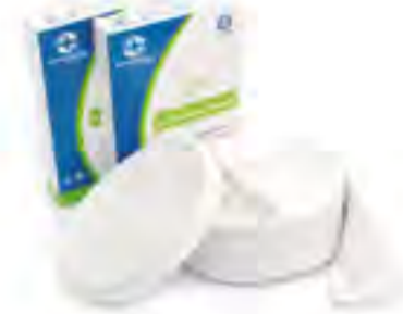
SA10 - Tubular Net Bandage Size: 0#(0.6cm), 0.5#(0.9cm), 1#(1.7cm), 2#(2.0cm), 3#(2.3cm), 4#(2.7cm), 5#(3.0cm), 5.5#(3.5cm), 5.8#(4.2cm), 6#(5.8cm), 7#(7.2cm), 8#(8.5cm), 9#(9.0cm), 10#(10cm). Color: bleached white. Type: i) polyester + rubber; ii) polyester + spandex.