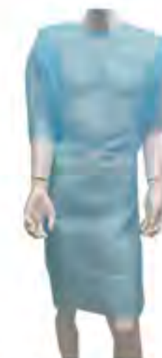
SJ14 - PP Isolation Gown with short sleeve Size: 110 x 130cm(S), 115 x 137cm(M), 120 x 140cm(L), 125 x 145cm(XL), 130 x 150cm(XXL), etc. Color: blue, green, yellow, white, etc. Material: PP non-woven. Weight: 20gm 2 , 25gm 2 , 30gm 2 , 35gm 2 , 40gm 2 , etc.