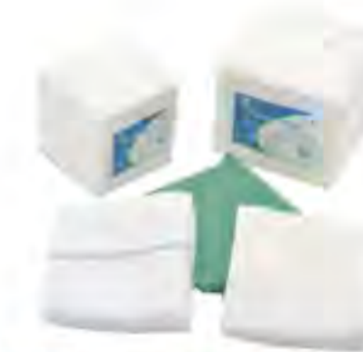
SG07 - Non-sterile Gauze Swabs Size: 5x5cm, 7.5x7.5cm, 10x10cm, 10x20cm, etc. Ply: 8ply, 12ply, 16ply, 24ply, 32ply. Edge: unfolded edge, folded edge. Mesh: 8threads/12x8mesh, 12threads/19x11mesh, 13threads/19x15mesh, 17threads/26x18mesh, 20threads/30x20mesh, etc. Color: bleached white. Material: 100% cotton (40's, 32's, 21's, etc). Type: i)without x-ray; ii)with x-ray.