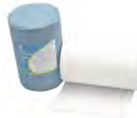
SG01 - Absorbent Gauze Roll Size: 90cm x 100yds, 90cm x 100m, 90cm x 50yds, 90cm x 50m, 90cm x 2000m, etc. Ply: 4ply, 2ply, 1ply. Mesh: 8threads/12x8mesh, 12threads/19x11mesh, 13threads/19x15mesh, 17threads/26x18mesh, 20threads/30x20mesh, etc. Color: bleached white. Material: 100% cotton (40's, 32's, 21's, etc). Type: i)without x-ray; ii)with x-ray.