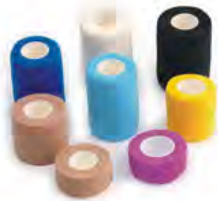
SC01 - Cohesive Elastic Bandage (Non-woven Type) Size: 2.5cm x 4.5m, 5cm x 4.5m, 7.5cm x 4.5m, 10cm x 4.5m, 15cm x 4.5m. Color: skin, white, blue, green, pink, red, yellow, orange, black, etc. Material: non-woven + elastic yarn + glue.