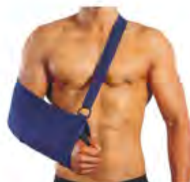
SM0813 - Arm Sling Size: S, M, L, XL. Material: polyester cotton fabric + polyester strap + POM buckle.