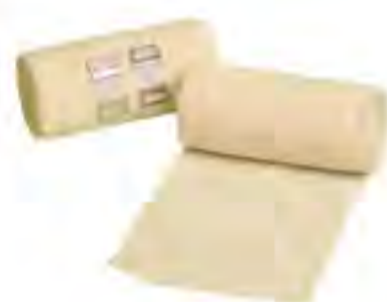
SA06 - Ideal Bandage (Thick PBT) Size: 5cm x 4m, 7.5cm x 4m, 10cm x 4m, 15cm x 4m. Weight: 60g/m 2 . Color: natural white. Material: polyester + cotton.