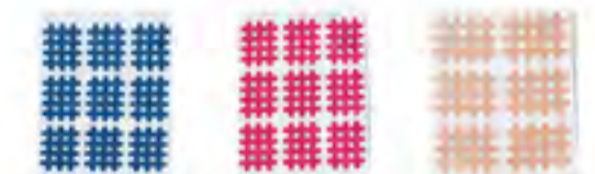
SE28 - Lattice Adhesive Tape (Cross Tape) Size: 22x28mm, 28x36mm, 44x52mm. Color: blue, pink, skin. Material: silk fabric + glue.