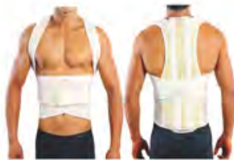
SM0806 - Back Support with Aluminium Alloy Holder Size: S, M, L, XL. Material: mesh fabric + foam + velvet + aluminium alloy holder.