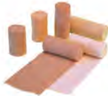
SA01 - High Elastic Bandage Size: 5cm x 4.5m, 7.5cm x 4.5m, 10cm x 4.5m, 15cm x 4.5m. Weight: 80g/m 2 , 90g/m 2 , 100g/m 2 . Color: skin, white, orange. Material: polyester + rubber.