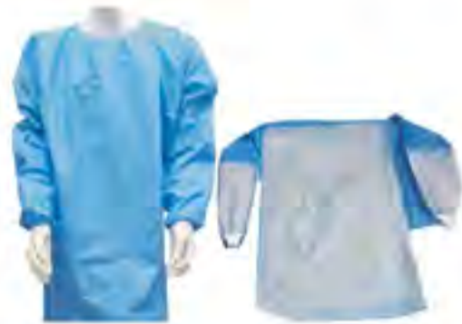
SJ18 - Sterile SMS Reinforced Surgical Gown Size: 120 x 140cm(L), 125 x 145cm(XL), 130 x 150cm(XXL), etc. Color: blue, green, white, etc. Material: SMS. Weight: 30g/m 2 , 35g/m 2 , 40g/m 2 , 45g/m 2 , etc. Packaging: 1pc/pouch.