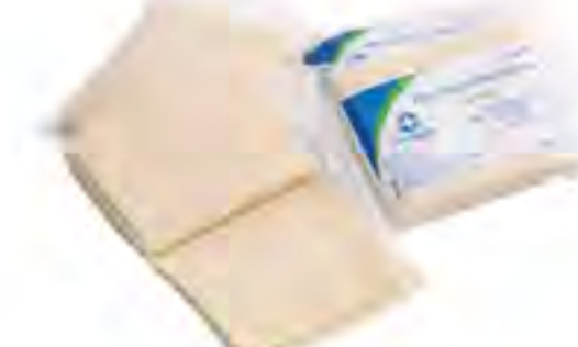
SG25 - Triangular Bandage Size: 36"x36"x51", 40"x40"x56", etc. Mesh: 48x48mesh, 48x30mesh, etc. Color: natural white. Material: 100% cotton.