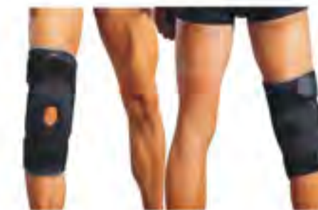
SM0510 - Knee Support with Aluminium Alloy Holder (neoprene) Size: one size fits all. Material: neoprene + nylon + aluminium alloy holder.