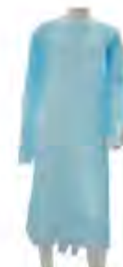
SJ24 - CPE Gown Size: 108 x 172cm(S), 110 x 193cm(M), 116 x 202cm(L), etc. Color: blue, green, yellow, white, pink, etc. Material: CPE. Weight: 35g/pc, 40g/pc, 45g/pc, etc.