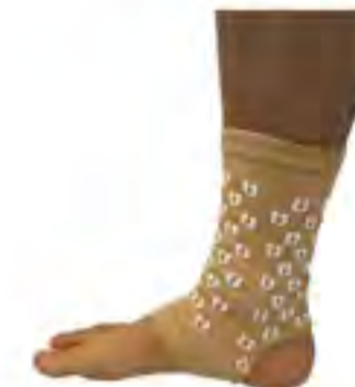
SM0704 - Ankle Support (far infrared ray) Size: S, M, L, XL. Material: polyester + latex + far infrared ray.