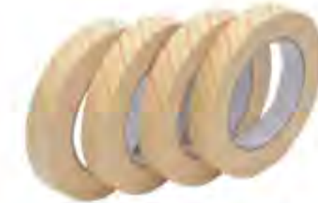
SL08 - EO Sterilization Indicator Tape Size: 12mm x 50m, 19mm x 50m, 25mm x 50m, etc. Color Change: from Red to Yellow. Material: paper + ETO sterilization indicator ink.