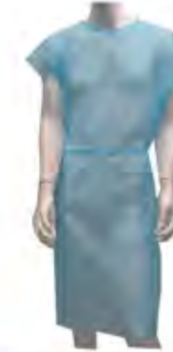
SJ15 - PP Isolation Gown without sleeve Size: 110 x 130cm(S), 115 x 137cm(M), 120 x 140cm(L), 125 x 145cm(XL), 130 x 150cm(XXL), etc. Color: blue, green, yellow, white, etc. Material: PP non-woven. Weight: 20gm 2 , 25gm 2 , 30gm 2 , 35gm 2 , 40gm 2 , etc.