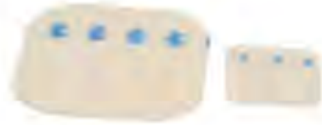
SF02 - Hydrocolloid Dressing (extra thin) Size: 5x5cm, 10x10cm, 15x15cm, 15x20cm, 20x20cm, etc. Material: pressure sensitive adhesive + CMC.