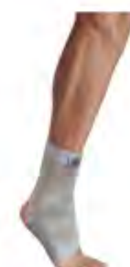
SM0205 - Ankle Support (skin nylon) Size: S, M, L, XL. Material: nylon + latex + spandex.