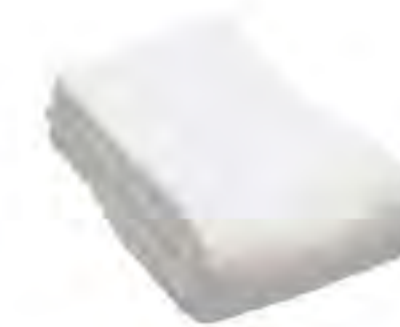
SG02 - Zig-zag Gauze Size: 90cm x 100yds, 90cm x 100m, 65cm x 5m, etc. Mesh: 8threads/12x8mesh, 12threads/19x11mesh, 13threads/19x15mesh, 17threads/26x18mesh, 20threads/30x20mesh, etc. Color: bleached white. Material: 100% cotton (40's, 32's, 21's, etc). Type: i)without x-ray; ii)with x-ray.