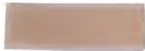
SF18 - Silicone Gel Sheet Size: 2x12cm, 3x12cm, 4x30cm, 5x7.5cm, 5x18cm, 6x12cm, 10x18cm, 12x15cm, etc. Material: PU film + silicone gel.