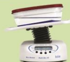
Multi Bio 3D, Mini Shaker

Applications: Agglutination Gel staining/ destaining