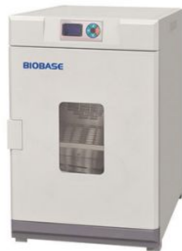
BOV-V70F/BOV-V136F/BOV-V225F/ BOV-V429F/BOV-V640F/BOV-V960F (Optional RS-485 interface for this series)