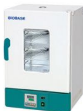
BOV-V30F/ BOV-V45F/ BOV-V65F/ BOV-V125F