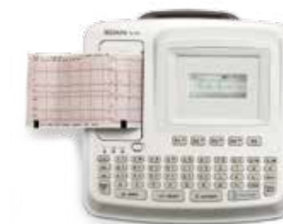
SE-601A (3.5" Monochrome LCD Display)