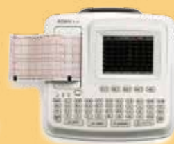
SE-601 Series Electrocardiograph