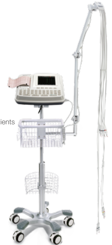
SE-601C With Rolling Stand (5.6" Color Touch Screen)