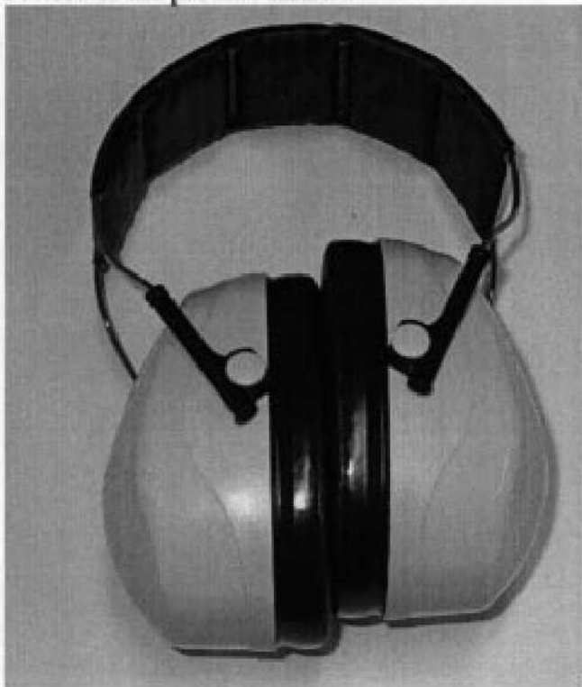
Picture of the product H520A